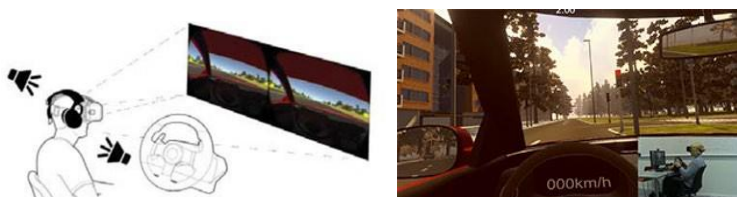
Figure 2. System description of the NeuroCar evaluation tool and street view from the NeuroCar training solution.

Before focusing on marine industry we have studied virtual reality in driving inspection (Luimula et al., 2015; Hämäläinen et al., 2017). As a result we created NeuroCar evaluation tool for a simultaneous evaluation of driving acuity and spatial perceptual capacity. In addition, we have developed training solutions for drivers.