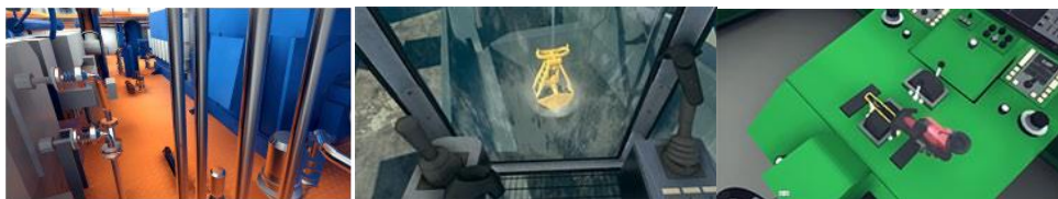
Figure 1. Three VR training solutions for marine industry.

Before focusing on marine industry we have studied virtual reality in driving inspection (Luimula et al., 2015; Hämäläinen et al., 2017). As a result we created NeuroCar evaluation tool for a simultaneous evaluation of driving acuity and spatial perceptual capacity. In addition, we have developed training solutions for drivers.