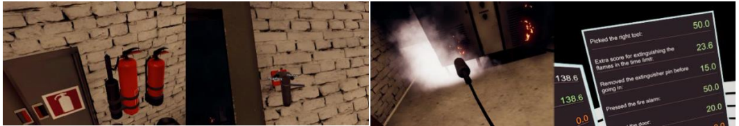
Figure 4. The application is monitoring player's behavior and the feedback is shown at the end of the training.

After selecting the CO2 fire extinguisher, releasing the pin and opening the door, the smoke floats in the air and also player's face gets smoke. The player has to approach the burning object in the pile and stay on his knees during the shutdown. The player should be able to point the nozzle to the root of the flames and the trigger handle must be able to be pressed. Our training solution is tracking and tracing the player's behavior during the game. The player should be able to pick up the correct tool. Extra score will be given if extinguishing the flames in the time limit. The player should remove the pin before going in. In addition, the player should press the fire alarm, and close the door at the end. The player will be given penalty score for standing in the smoke or if going too close to the fire. All this feedback is visualized for the player at the end of the learning episode. If needed the player is able to start all over again to make enough repetitions for the correct actions. The duration of this learning episode is around 10 minutes and application contains minimal textual information which can be translated easily for different nationalities.