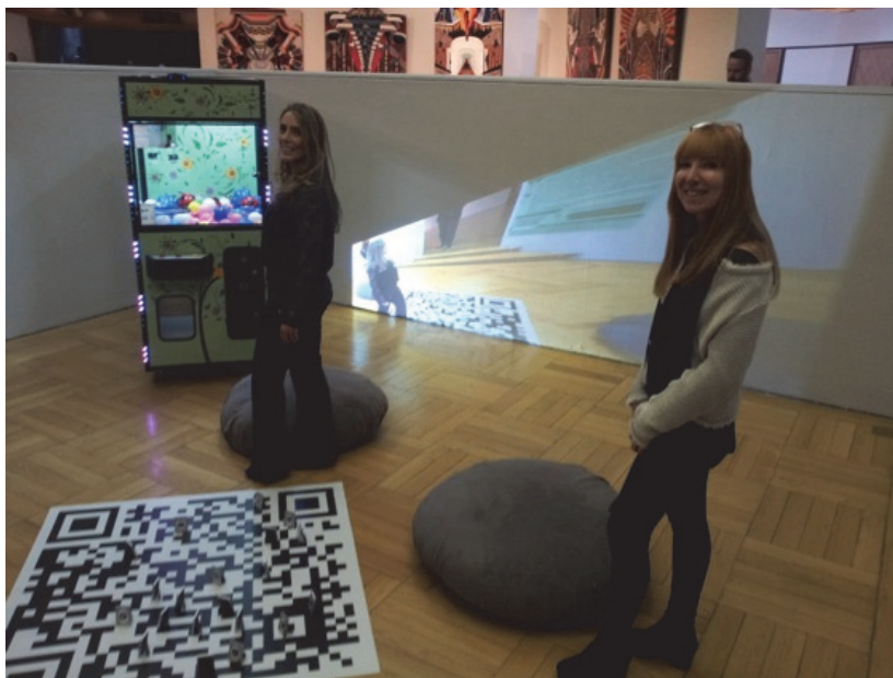
Figure 7. Exposition Paço das Artes, São Paulo/SP, 2014.

The EXTINCTION! Curated by Priscila Arantes was held in 2014 at the Paço das Artes museum in São Paulo. Machine for picking up stuffed animals, as amusement park cranes are popularly known, are the machines (Toy Machines) proposed here in the EXTINCTION installation! to compose a gamearte computer system, considering the hybridization between art, activism, design, ubiquitous / pervasive computing and augmented reality. The visitor was invited to play at the Animal Picking Machine, where he could, at a certain time, pick up balls or boxes with markers that only showed the Mico-Leão animal in a virtual way, through the system known as Augmented Reality. The visitor could take the ball he could get, like a fetish. To play it was necessary to buy little files that were inserted into the machine, thus starting the system. The proceeds were donated to Greenpeace, whose mission is to preserve forests. The poetics relates the virtual image with the situation of the living species on our planet that are threatened by deforestation and other factors that are currently impairing their survival.