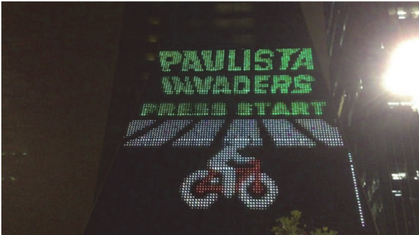
Figure 3. https://www.youtube.com/watch?v=Sy7Ub6p3Ytk