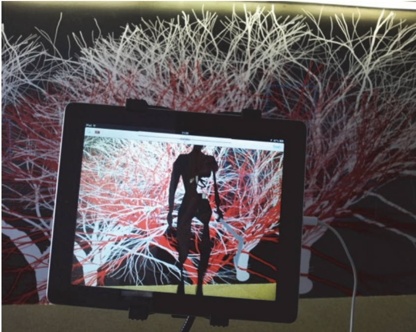
Figure 8. DesflorestamentoZero, Museu Nacional da República, 2014/2015

DeforestationZero was presented as an interactive installation with augmented reality technology. The poetics of the work addresses the launch of the ZERO DEFORESTATION campaign, led by Greenpeace, to bring a law of popular initiative to Congress, seeking to combat rampant deforestation in Brazil. And for this to happen, popular participation was necessary to obtain 1.4 million signatures from Brazilian voters, in addition to generating a large national movement in defense of forests to guarantee their approval.