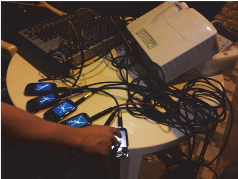
Figure 1. Geopartitura system composed of cell phones connected to the software, Brasília, 2011

The geopartitura system (figure 1) used locative media which, for André Lemos (2006), is defined as a set of technologies and info-communicational processes whose informational content is linked to a specific place. Locative is a grammatical category that expresses place, such as "in", "next to", indicating the final location or the moment of an action. Locative media are digital informational devices whose information content is directly linked to a location. These are processes for sending and receiving information from a specific location. Mobile media is media that is always transported, always connected and always present at the point of creative impulse.