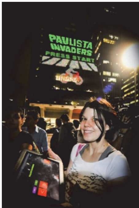
Figure 2. Paulista Invaders, 2013

The first presentation was at Avenida Paulista, in São Paulo, as part of the Play exhibition, which occupied the facade of the building of the Federation of Industries of São Paulo (figures 2). The proposal contains characteristics of a political manifesto, part of an activist and playful artistic action. Human-computer interaction was carried out with a tablet on the street and the Fiesp building itself interacted with the gamearte.