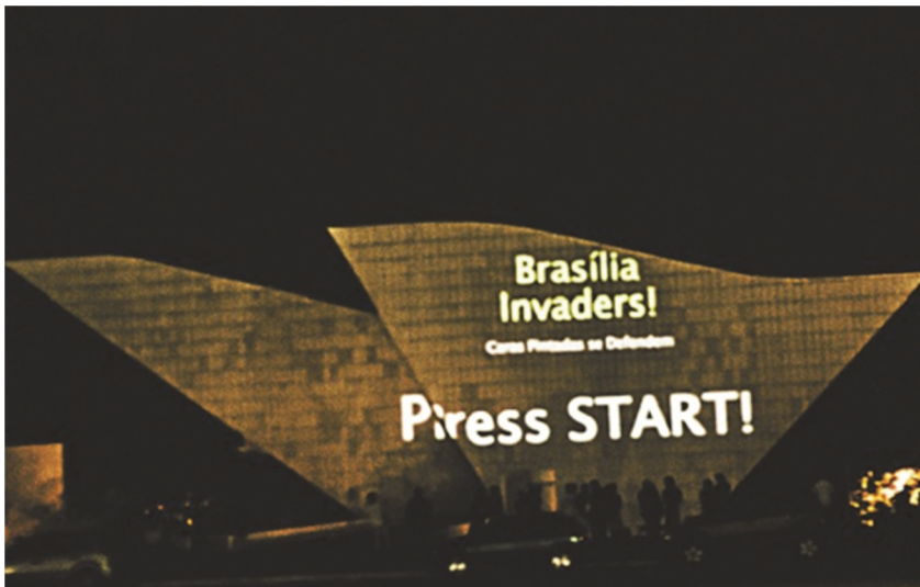
Figure 4. Projection on the facade of the Pantheon - Esplanada dos Ministérios, Brasília, DF, 2013