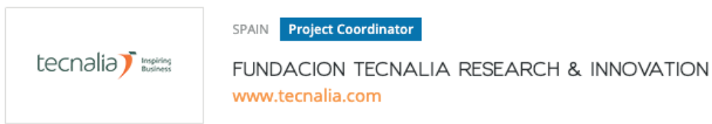
Caption 3. Proper noun of institution in combination with logo in Indus3Es website.

Another example of the multimodal affordances exploited in these webs is found is the use of proper nouns to refer to institutions in combination with the logo of the institution and the hyperlink to their own website, typically found in the Partners page, as mentioned in section 3.2: