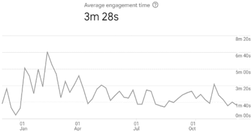
Figure 2. Session duration time