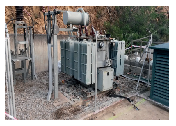
Figure 3: Power transformer replacement work due to predictive maintenance data analysis (dielectric oil analysis) (Enel Green Power-Endesa Generation).

Table 6: Predictive maintenance techniques used in high reliability equipment.