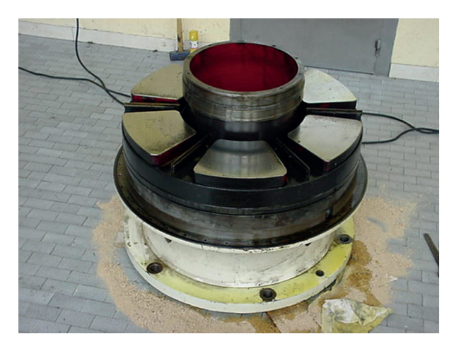
Figure 2: Assembly work of oil injection circuit to the pivot bearing of the hydroelectric group due to redesign by preventive maintenance analysis (Enel Green Power-Endesa Generation).

Preventive maintenance is based in proactive tasks that they are carried out before the failure occurs in order to prevent the equipment from reaching the fault state. A maintenance operation is technically feasible if it physically reduces the consequences of a failure mode to an acceptable level. Figure 2 shows a redesigned maintenance action based on the preventive maintenance actions considered.