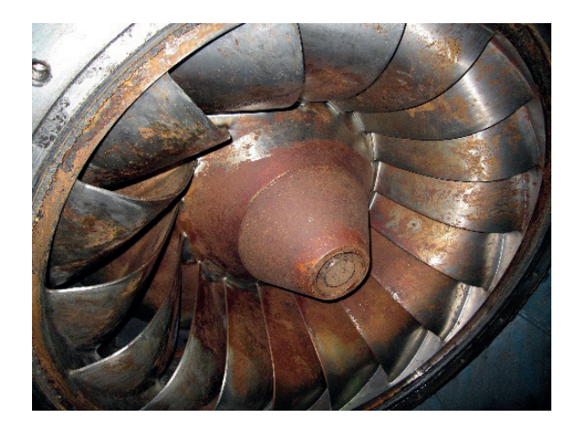
Figure 4: Mechanical disassembly of the hydroelectric group turbine due to predictive maintenance analysis (vibration and cavitation analysis).