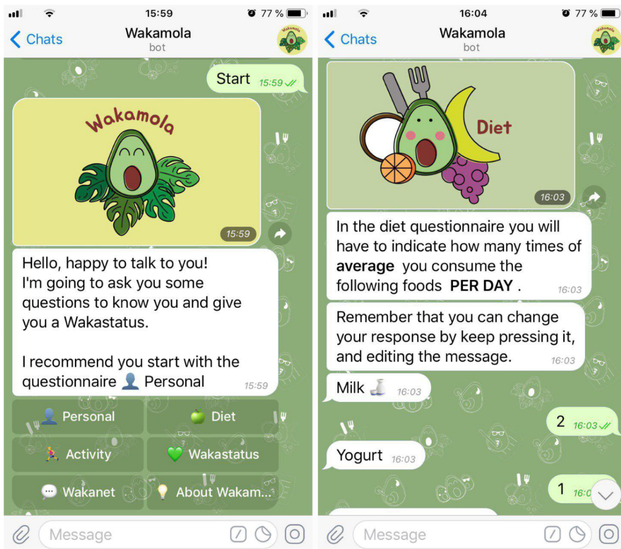
Figure 1. Screenshot of Wakamola's main menu and diet section.

Based on the users' survey and expert criteria involved in the study, we decided to include six sections in the chatbot: Personal, Diet, physical activity habits (Activity), social network (Wakanet), status (Wakastatus), and project information (About Wakamola) (Figure 1; Multimedia Appendix 2). "Personal," "Diet," and "Activity" were interactive surveys based on standardized questionnaires, whereas "social network" implemented a sharing mechanism based on a sticky strategy. More importantly, we defined a novel user status assessment named Wakastatus. It was a gamified version of an obesity risk assessment based on diet, physical activity, and neighborhood (relationships) status to give feedback and motivation to the user. Moreover, the word "risk" was changed to "status" to provide a positive message for the user's obesity and overweight assessment. Further information about gamification elements in Wakamola are available in Table 1 and Multimedia Appendix 1.