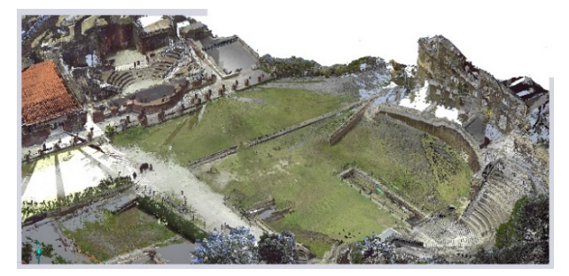
Figure 2: Laser scanning point cloud.

The survey of the area (ca 1 ha) required a multitechnique procedure. The entire area was firstly surveyed with a TOF laser scanner (Faro Focus 3D), planning and acquiring 29 medium resolution scans. This instrument has a range noise less than 1 mm for measurements up to 25 m. The scans alignment and registration were carried out with the proprietary software, using printed checkerboard targets and spheres, distributed within the field of view of the instrument. The final point cloud is of about 338 million points (Fig. 2). The main difficulties of the TLS survey were the handling of the large quantity of data as well as the colouring of the point cloud due to overlapping scans and low-res embedded camera.