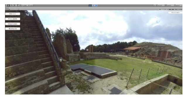
Figure 5: A panoramic view of the site inside Unity 3D gaming engine.

aim of promoting the knowledge of the historical heritage for its preservation.