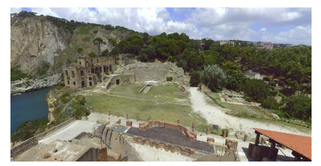
Figure 1: General view of the archaeological area in Pausilypon.

to 2.000 people. On the opposite side of this area, there is a smaller Odeon which was originally covered.