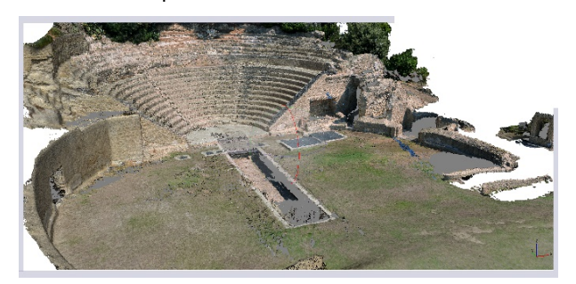
Figure 3: Photogrammetric dense point cloud.

model presented topological errors due to different and complex surfaces, required a long post-processing phase and was finally textured for the successive valorization steps.