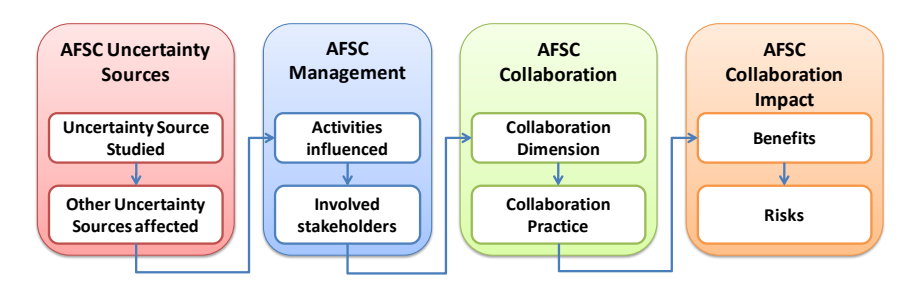
Fig. 3. Conceptual framework for managing uncertainty in a collaborative AFSC context

collaboration level could offer more benefits in reducing uncertainty, decision-makers have to make a balance between the level of uncertainty and resources consumption they are ready to assume and the benefits they are obtaining in return. This reason justifies the application of the proposed CF to decide the collaborative practice to implement by collecting the needed information to make an adequate decision.