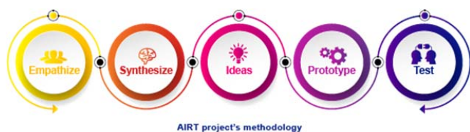
Fig. 1 Detail of the Design Thinking methodology used in the AiRT project.