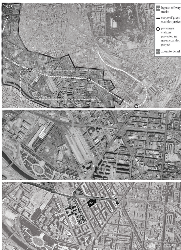
Figure 3. Urban regeneration plan for the south and west interior border of Madrid in the late twentieth century: Pasillo Verde