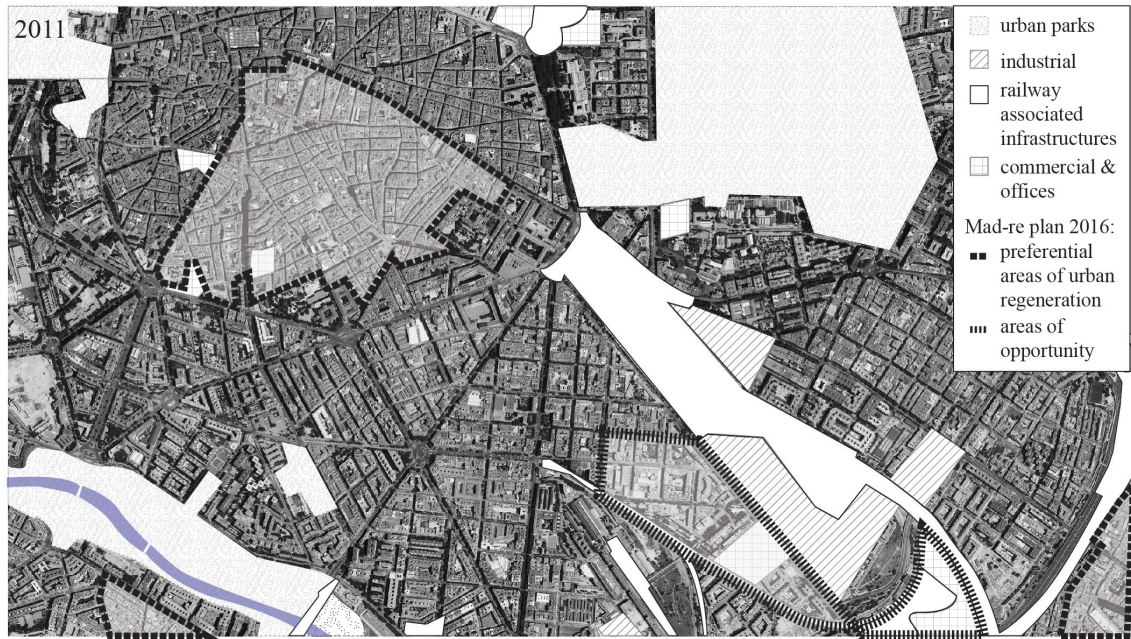
Figure 4. Land use, urban regeneration and spaces of opportunity in the south of Madrid