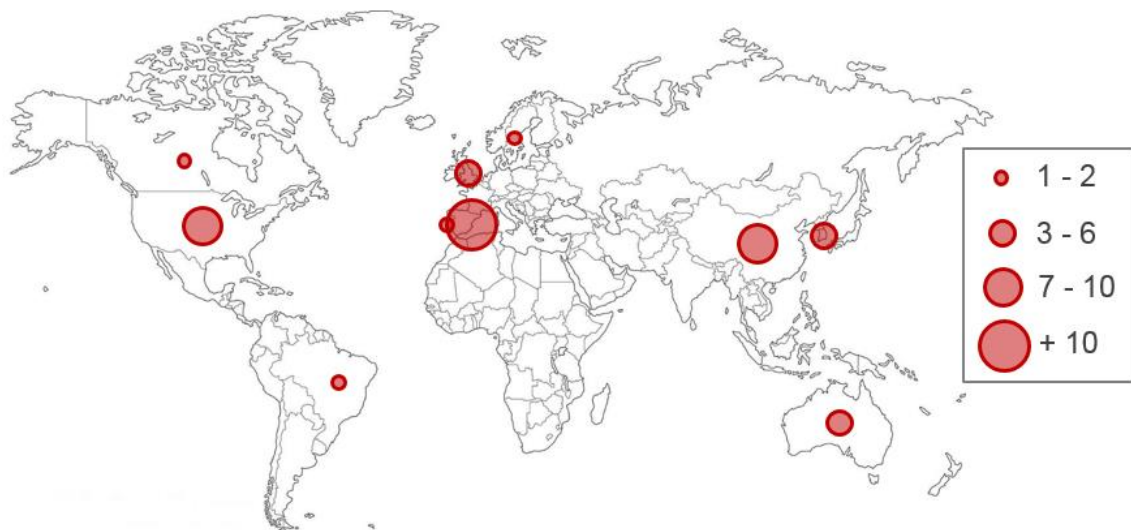
Fig. 2. Regional distribution of research on load transmission between slabs and shores.

considered to be a crucial aspect for the correct design of both permanent and temporary structures. Below, the review deals with these aspects in greater detail, dividing the studies into: a) methods of estimating load transmission between slabs and shores during the construction of RC building structures, b) experimental studies and c) numerical studies. Figure 2 shows the distribution of the papers in this field indexed in Scopus and Web of Science. The research groups responsible for these publications belong to: Australia, Brazil, Canada, China, Portugal, South Korea, Spain, Sweden, USA and the United Kingdom. In all these countries the studies carried out were transformed into published papers. Figure 2 gives precisely the numbers of papers published in each country, while Figure 3 shows their evolution. Interest in the subject (slope of the curve) can be seen to have increased from about halfway through the 20th century up to the present time.