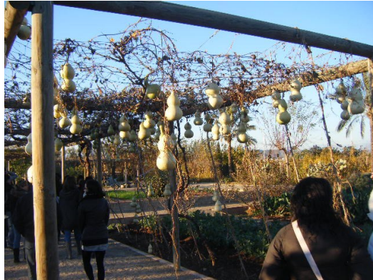
Fig.2 Visit to the Environmental Education Center of the C.V.

Perceptual analysis of THERMAL-LUMINAL comfort in areas shaded by vegetation in design education centers.