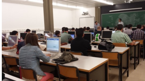
Fig.1 Classroom design