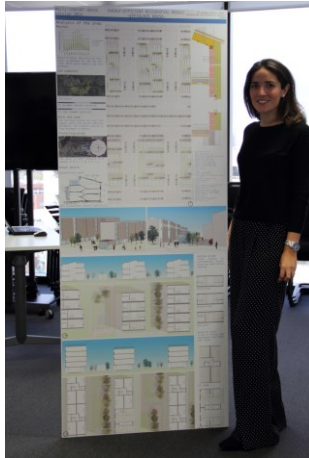
Fig.4 Project representation environmental

Students are invited to participate in project competitions where sustainability, technological innovation and low energy consumption are rewarded, obtaining very interesting results due to their high quality, such as the one shown in figure 4.