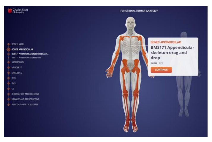
Figure 2. Smart Sparrow interface showing list of available lessons