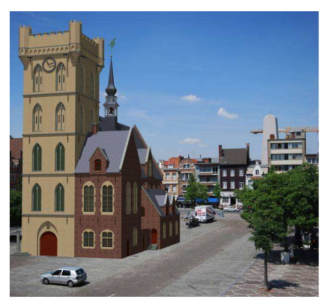
Figure 3. Virtual reconstruction of the belfry of Roeselare, Belgium, from unpublished sources

We are convinced that virtual archaeology needs to gain scientific credibility by adopting such methodologies, and by using computer based visualisation as a research tool. In the past, virtual archaeology has been seen too much as a communication tool, with too little attention to scientific background and incorporation of all available research.