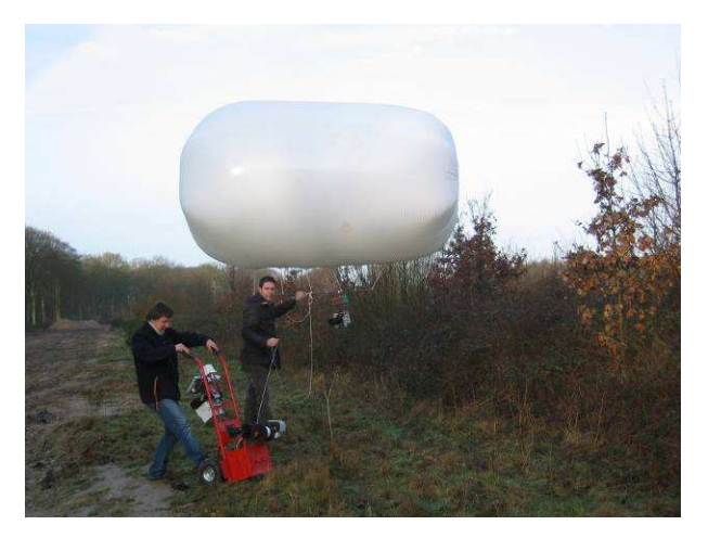
Figure 2. Balloon to photograph buildings for 3D reconstruction (Aurea Imaging)