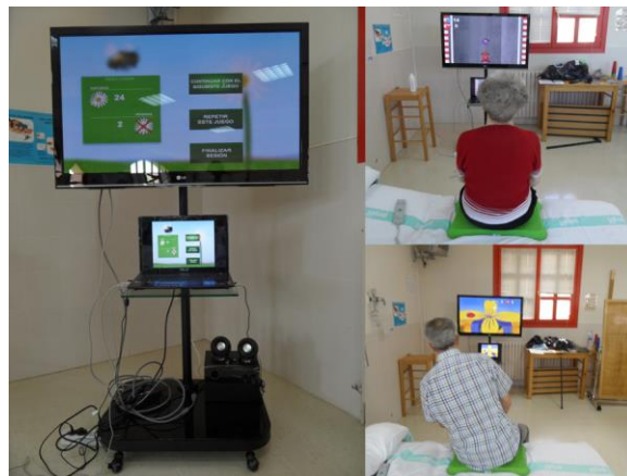
Figure 1 Patients with PD using the ABAR system

When the participants maintained the position to achieve the targets, we selected the pressure that the participants performed when