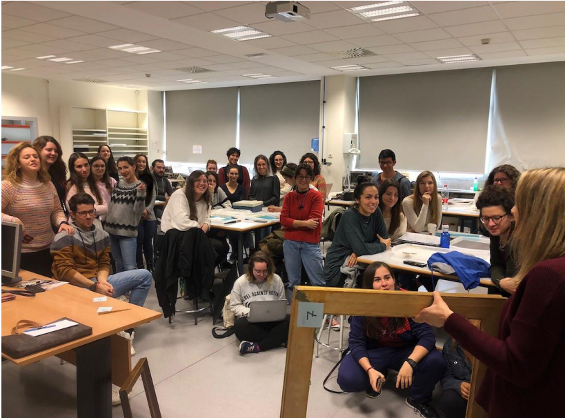
Fig. 3 Resolution of the practice

When the students completed the activity, a pooling of the 15 groups, referring to the whole practice, was carried out, drawing a series of conclusions, which were being led by the teachers, coming to the resolution of each of the analyzed cases.