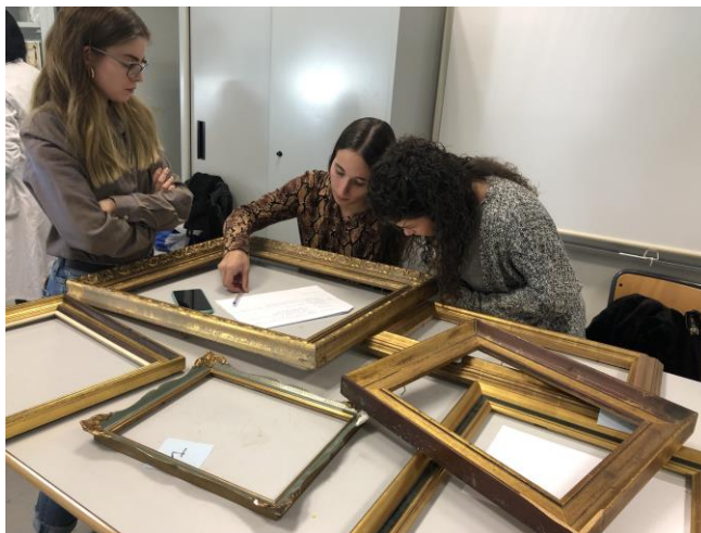
Fig. 2 Cooperative Learning

When the students were clear about their hypotheses, regarding the practice, they put everything in common, through the technique of brainstorming, trying to understand the technique of gilding of the frames and the materials used for it. The data that each of them was appointing, in practice, was being recorded in a portfolio that the faculty had prepared, with the questions they had to discuss and the aspects to which they had to pay attention to.