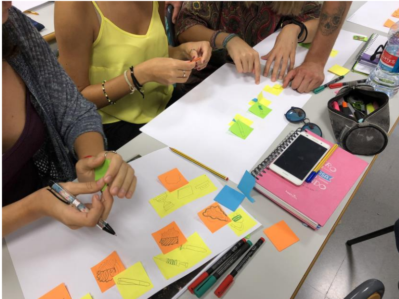
Image 2. Detail of a collaborative work session, in the subject Development, management and management of restoration projects.