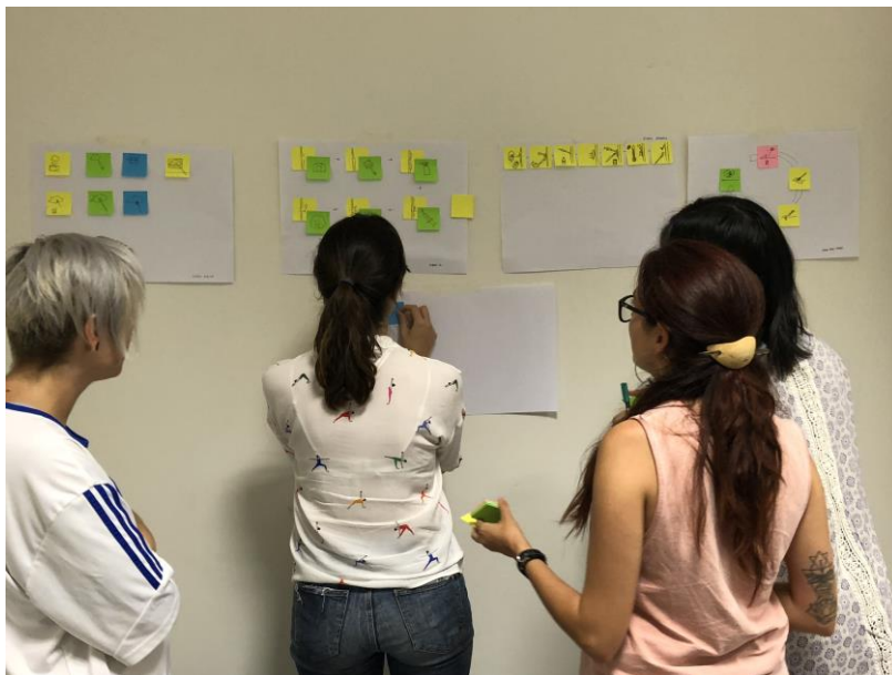
Image 1. Detail of a collaborative work session, in the subject Development, management and management of restoration projects.

linked to contemporary and current issues. Once the practice is finished, each group presents its answers and a directed debate is opened, in order to lead and build the appropriate response among all. As a conclusion, the teacher presents some slides that synthesize the answer to the question posed, strengthening the most important aspects of the new concept acquired. In this way, through the answers of the key silver questions, the students construct in a directed way the theory linked and applied to contemporary issues.