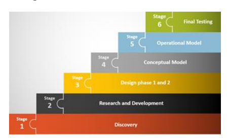
Fig.1 Game design process (adapted from Becker & Parker (2011)

When designing Chuzme , several models were reviewed to identify the one best suited for the project. After careful consideration, to support Chuzme's game design phase, the ATMSG model (Callaghan, McShane, Eguíluz, & Savin-Baden, 2018; Carvalho et al., 2015) was chosen for its complex and dynamic view on serious games, while the overall design process was guided by the serious instructional design process, developed by Becker & Parker (2011) as a combination of simulation design (SD), game design (GD) and instructional design (ID). The serious instructional design process consists of six phases. The first phase, "Discovery", encompasses the needs analysis and rough outlines for framing the project in its proper context. This phase identifies the game's main objectives and premise and also develops a general understanding of who the game's intended users are, how these users will obtain what they need, and how one can know that they have. During the second phase, "Research", materials and facts are gathered, and limitations and original systems are defined. Figure 1 summarises models.