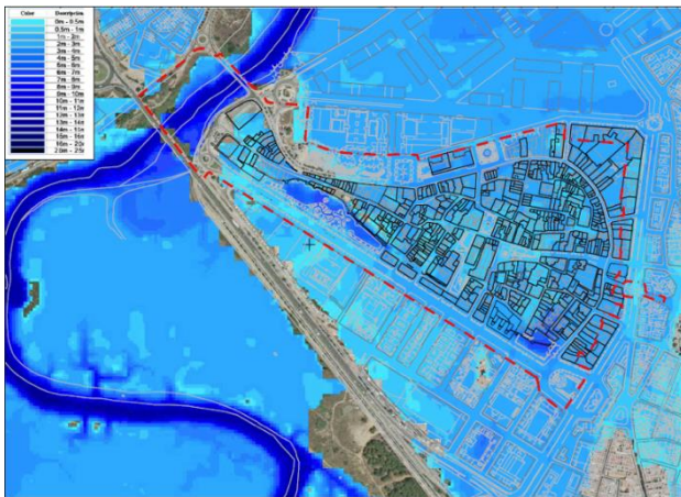
Figure 7. Draught levels. Return period of 500 years. (SNCZI)

The vulnerability factors of earthen architecture under consideration will then be identified, distinguishing susceptibility factors (negative elements that increase risk in relation to danger) and resilience factors (positive factors that mitigate risk). Vulnerability analysis, which is related to damage analysis, will start with the identification of the factors which can cause damage to buildings, and the stresses that can lead to complete collapse of the building, such as hydrostatic and hydrodynamic forces or detritus impact. These factors will be evaluated in relation to the morphology of the building, its construction technique and the state of preservation, highlighting the existing degradation mechanisms and the restoration works already carried out.