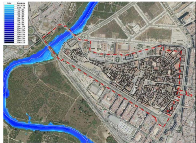
Figure 5. Draught levels. Return period of 10 years. (SNCZI)