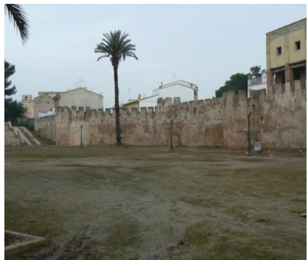
Figure 3. The Moorish wall (PEP – Alzira).

Although individual cultures have developed their own unique technique of rammed earth, there are features which are common to any construction tradition (Guillad, 2012): the nature of the soil (sandy land, rich in gravel and poor in clay), the instruments (wooden formworks) and the construction process (to compact the earth with a ram). One of the weaknesses of earthen architecture is its sensitivity to water; this results in the formation of cracks in dry-wet cycles, decreasing the resistance of the structural system. Nevertheless, a major advantage for the conservation of the cultural heritage of earthen architectures is their reparability.