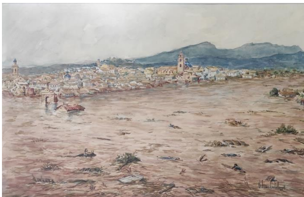
Figure 2. Alzira after the 1864 flood.

The specific configuration of the Vila as a river island probably influenced the development and urban layout of the city, as well as its buildings. Although the river was a natural defence against external dangers, it has also always been a threat to the city, which has often been affected by the floods of the Júcar. In 1795, the botanist Cavanilles, describing the city of Alzira in his work "Observaciones sobre el Reyno de Valencia", emphasizes the particular configuration of the town embraced by its river and warns of the dangers of possible flooding (Tabernes et al., 2017). In fact, flooding can be identified as one of the main causes of deterioration - and often loss - of its architectural heritage. The constant threats posed by the river and the need for urban expansion necessitated the diversion of the smaller branch of the river, whose ancient riverbed was later reused for the construction of two large roads.