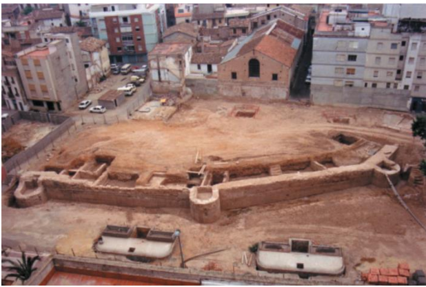
Figure 4. Archaeological excavation of the wall. (PEP – Alzira)