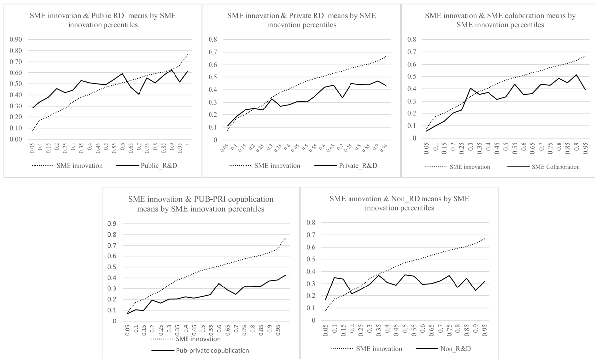
Fig. 1. Mean variation of variables across regional SME innovation quartiles.

according to the level of development of each region. To test whether this is the case, we use quantile regressions as a means to assess how the factors that affect SME innovation change according to variations in regional innovative capacity. The advantage of quantile regressions is that —by allowing estimating effects at different points in a distribution— they take into account the heterogeneous capacity of SMEs to innovate in regions at different levels of development.