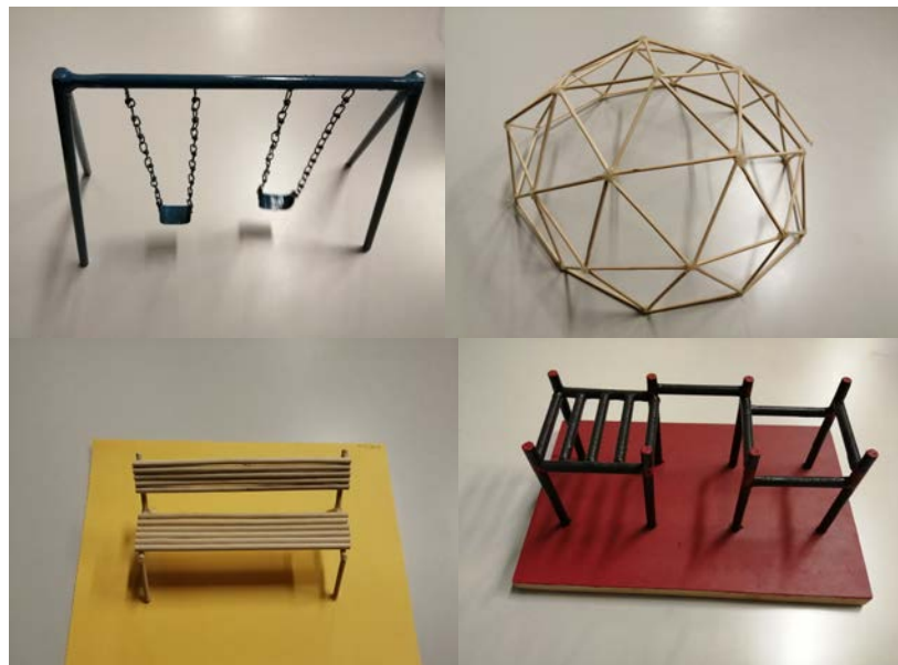
Figure 2. Models constructed by students.

Figure 2 shows some models constructed by students.