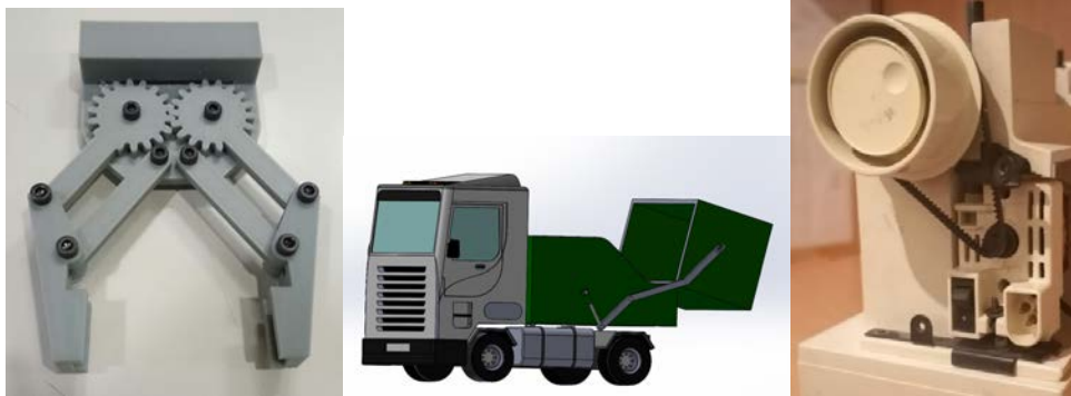
Figure 1. Different models created by using 3D printing, computer aided design software and recycled components.

With all these requirements in mind, a learning activity was designed to fulfil as many of them as possible. This activity involves a comprehensive analysis of a real mechanism from the point of view of the Theory of Machines and Mechanisms. This analysis goes from a historical review to the dynamic analysis using numerical simulations and analytical methods and includes the modelling of the mechanism by using any suitable technique such as 3D printing, CAD-CAE, recycled parts and so on. Some examples of these models are shown in figure 1.