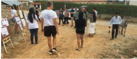
Fig.10. Final exposition of Volunteers' work in collaboration with local authorities and GFA Consulting (Source: Cristini, 2021).

quite vulnerable and fragile, on the other hand by the fact that the traditional agriculture with a high level of self-sufficiency is expected to terminate soon since it is currently mostly practiced by people older than sixty years. Finally, the smaller vernacular edifices are endangered because they are not understood by the local community as valuable, but as a part of their every-day life (Fig. 10).