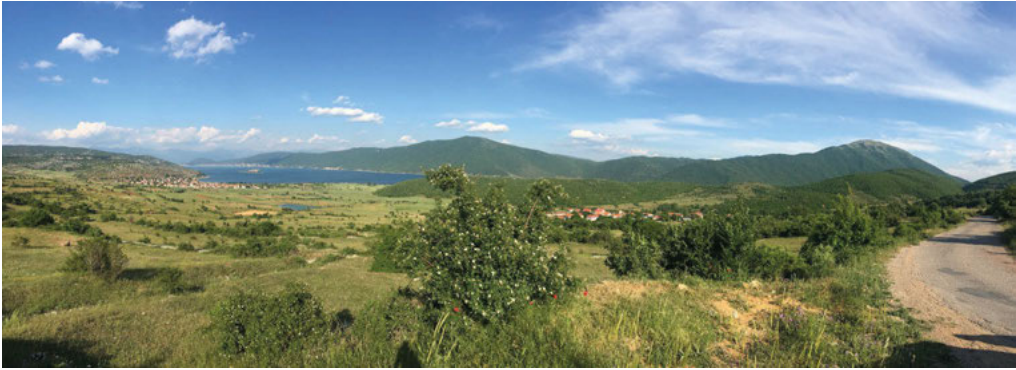
Fig. 1. Zaroshke surrounded by fields and its relation with Big Prespa Lake.

Exchanges between participants coming from different cultural and educational backgrounds make up an essential part of European Heritage Volunteers' concept – students of heritage-linked subjects often obtain their first practical experiences in their study-field during training courses and volunteering projects, whereas they have the opportunity to share their theoretical knowledge with participants who have more hands-on experience. In this frame, sharing the same values as European Heritage Volunteers, Polytechnic University of Valencia was involved in a teaching summer project in order to foster and better understand intangible and tangible values of the Albanian part of the Prespa Lake Biosphere Reserve. This is to contribute to conserve the richness of the cultural frame of the region and to improve policies of conservation, above all concerning traditional and vernacular architecture.