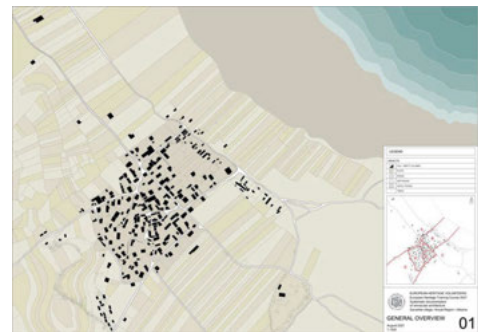
Fig. 2. Location plan of Zaroshke (Source: EHV, 2021).

former Yugoslavia in the north and to Greece in the east – to a quite isolated situation of the area (Fremuth, 2015). This isolation led to a high level of self-sufficiency and the conservation of traditional agricultural structures; the fact that the area is – in difference to the mainland – populated by Macedonians to a strong local identity (AA.VV., 2019b).