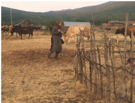
Fig. 3-4. Examples of rural buildings and still alive traditions at Zaroshke (Source: Cristini, 2021).

On the other hand, just the vernacular architecture of the area bears a big potential to keep and strengthen the local identity as well as for the touristic development of the region. In fact, if the value of the vernacular architecture would be well understood and conceptualised, the Prespa National Park could be the only national Park in Albania which attracts visitors by a combination of natural heritage and cultural heritage (Fig. 3-4).