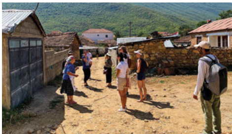
Fig. 6. Data collection in collaboration with local dwellers (Source: Cristini, 2021).

Volumes, cubature, roof structures, openings, colours and textures among others details are absolutely in contrast with inherited constructive techniques by existing architecture.