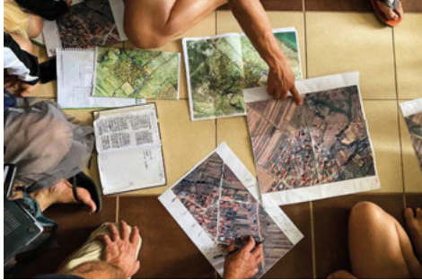
Fig. 7. Planning of work with volunteers (Source: Cristini, 2021).

of constructive techniques (walls, roofs, plasters, fences, openings etc.) was finally undertaken, in order to better understand possible problems linked to further maintenance guidelines (Pompejano, 2020).