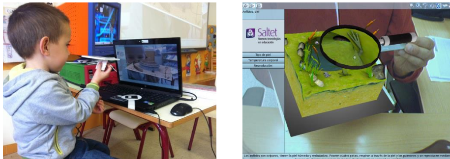
Fig. 3. (a) Preschooler using the AR application (b) Two marks interaction: magnifying glass

This AR application provides two activities, “Presentation” and “Lesson”, and it includes an innovative solution in AR. That solution is a special magnifying glass, which will be described below. The main objective of this application is to help the teachers to show the students the vertebrate animal classification and to show in detail these animals’ coats, kind of reproduction and corporal temperature. Thus, “Presentation” shows, over the AR marker, a kind of park where five animated couples of animals appear. This mode only allows the user to observe the scene; there is no more interaction than moving the AR marker and to observe the animals from different points of view.