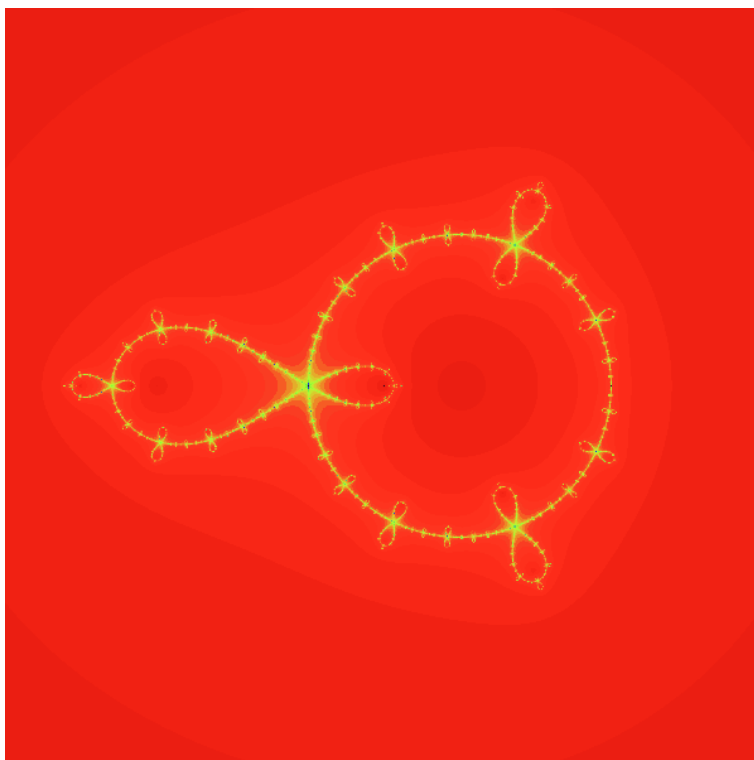
Figure 2. Julia set for the frozen derivative methods on quadratic polynomials

is more complicated than the one of Newton's method; nevertheless, all the points in the unit circle belongs to the Julia set (see Figure 2).