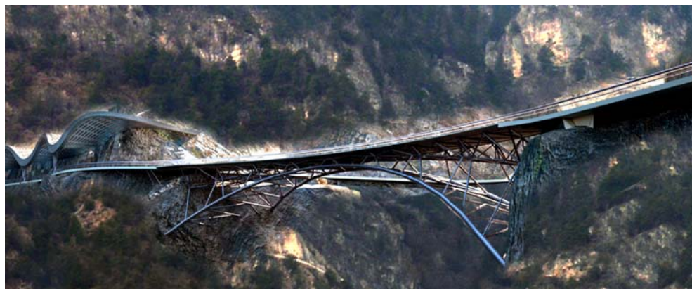
Figure 8: The arch bridge

integrative jet which will be covered by soil plant. Within the same project the new bridge, made by a reticular structure of steel pipes and tubes, formally and functionally arises in continuity with tunnel/landscape-system in a way that, both these works are not the result “neutral” technological solutions overlapping in different landscapes, but specific solutions fitting particular morphology of this place. The bridge takes the image of a traditional masonry concrete arch, to be carried in steel but with the emptying of the mass of walls and putting in highlights with the grid of rods from a possible metaphor stilature that are formed between the traditional concrete bridges.