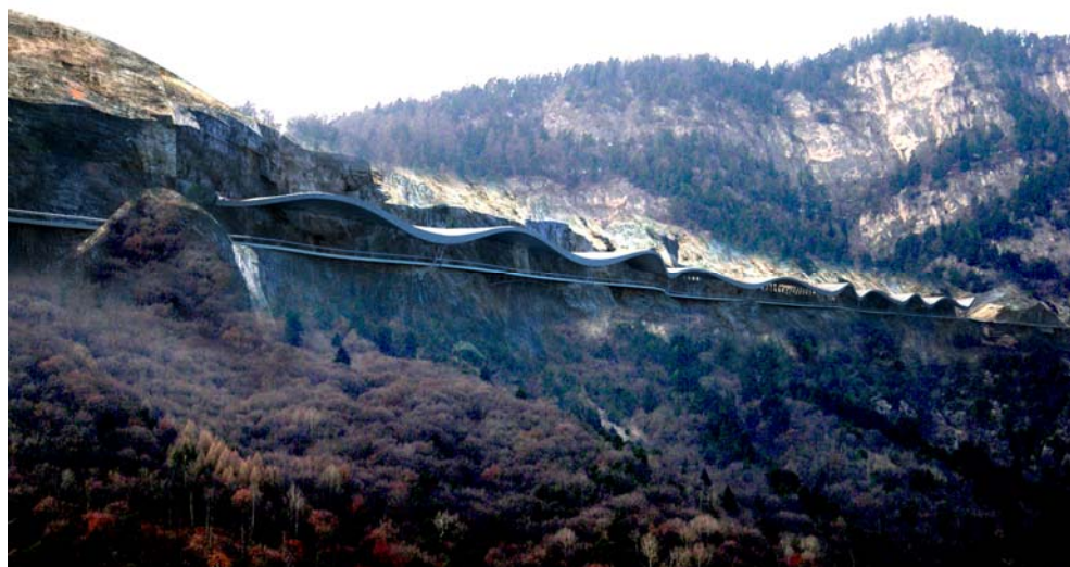
Figure 6: Relation between work and landscape