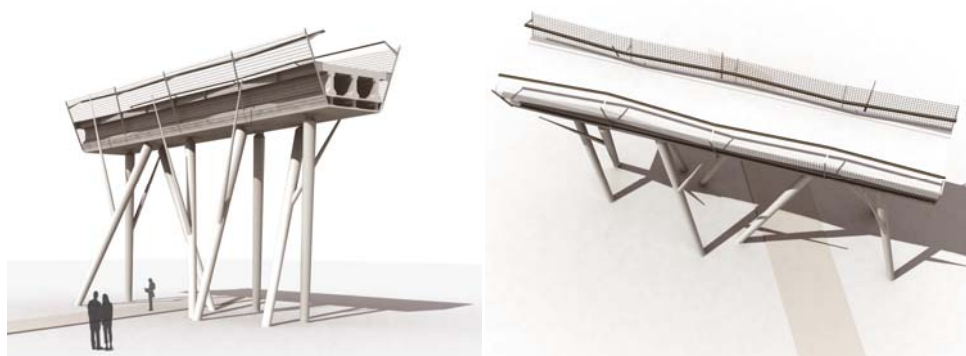
Figure 2: Virtual model of the footbridge