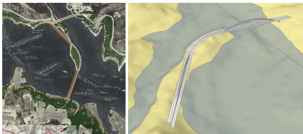
Figure 3: General plan of the area with placement of two bridge

A few years ago, Basilicata Region advertised a competition to realize a new bridge on Pertusillo Lake in order to connect town centre of Spinoso Municipality to S.S. 598 (Fondo Valle dell'Agri), actually provided by Pertusillo dam. The achievement of competition was comparing ideas to identify best and optimal solution to fit the new bridge to environmental and natural context, bringing green area of Pertusillo Lake out and making it recognizable. The aim was comparing the work with issue of nature, place of meeting, passage and dialogue for people. Therefore, became very important, the study on relationship between landscape and architecture, and between art and nature. Study draft hereinafter illustrated is