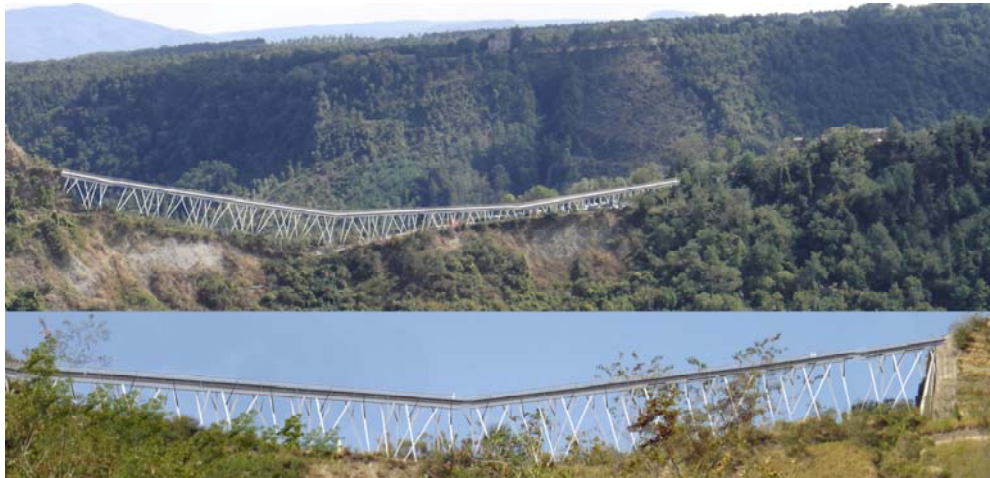
Figure 1: The bridge in the Landscape

constantly been changed and has always been a crucial problem for Civita, because there was the constant risk of the village being cut off altogether. The new footbridge was built in 1963 with absolutely no respect for its surroundings and is a typical reinforced concrete construction of the 60s, totally out of fitting with the village and now no longer adequate for its purpose. Consequently, the project aim was to propose a new image for the entrance road into the village, which has to be saved, that is set in an extremely interesting cultural site, keeping alive the historic, architectural and environmental values.