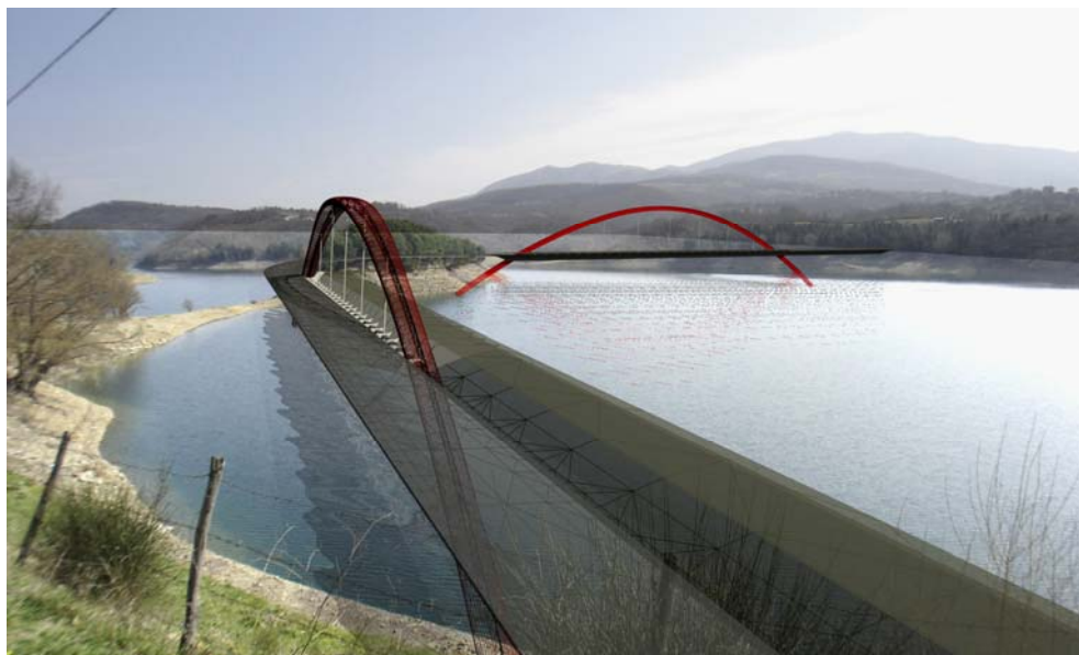
Figure 4: Rendering of bridges in the landscape

The select material for the realization of these two bridges is steel, considering strong light of two lines of crossing, workmanship and assemblage of the whole work.