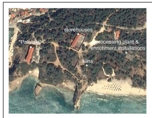
Figure 2: Map of the mining complex of Limenaria.

In the early 20th century, mining companies such as "Speidel-Pforzeheim" (1905-1912) and "Veille Montagne & Société Hellenique Metallurgique et Minière" (1925-1930) exploited the island's Zinc-lead rich calamine ores. In 1905 a metallurgical plant was erected at Limenaria, the second largest town of the island, for the calcination of the calamines in vertical and Oxland furnaces to produce ZnO. Later (1926) the calcination plant was rebuilt by Vieille Montagne with Waelz system rotary furnaces. Iron ore mining became important during the years 1954-1964. Several mining companies (Schmidt-Krupp and Apostolopoulos A.E., Chondrodimos S.A.) exploited the iron ore deposits of the island. It is estimated that total mineral production during the period 1905-1964 was about 2 million tonnes of calamine (12% Zn+Pb) and 3 million tonnes of iron ore (44% Fe). Since 1964 there has been no mining activity on the island.