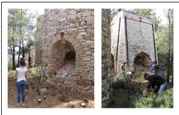
Figure 4: The kilns during vegetation removal.