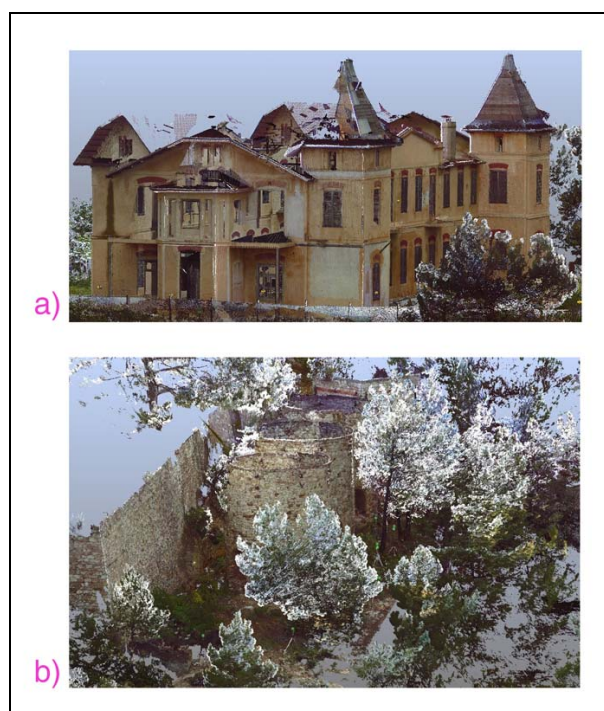
Figure 7: The colored point cloud of "Palataki" (a) and the kilns (b).

the whole area scanned. The finalized “noise-free” model consisted of 5 billion points.