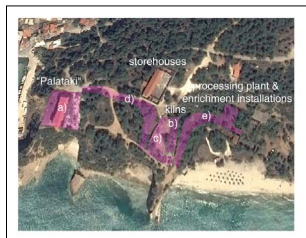
Figure 5: The selected buildings and sites to be scanned.

The selection of buildings and site to be scanned was made on the basis of two factors: (i) the importance and the state of risk of each building, and (ii) the duration of the Workshop (six days). Thus, the selected buildings and sites (Fig. 5) to be scanned were as follows: (a) "Palataki" and the kilns (furnaces), (b) the platform above the kilns, (c) the road that connects "Palataki" and the platform, (d) the road that connects kilns (furnaces), and (e) the factory (processing plant and enrichment installations). Initially, the area around "Palataki" and the kilns was cleaned and a bunch of trees was removed in order to capture the selected buildings.