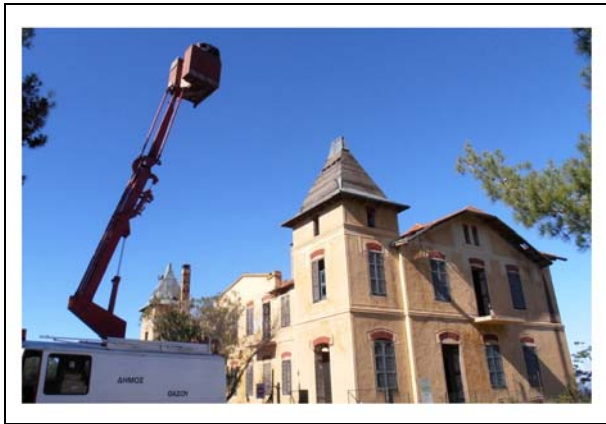
Figure 3: "Palataki" during data acquisition process.

later by its successor "Veille Montagne" (Fig. 4). After the 1930s recession, ore-processing was stopped and the great furnace-ramp was used only for hauling unprocessed ore to barges. Several other buildings complete the set of installations around the Limenaria area.