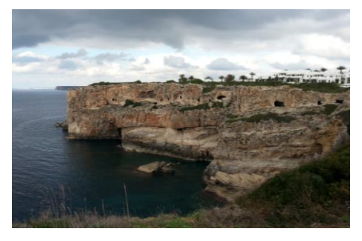
Fig. 2- View of the necropolis into the cliff

This intervention interested the outside (in the north) and the inside area (in the south) of the structure in cyclopean technique and the excavation in the necropolis of the Cuevas 3 and 22 (Figs. 2, 3).