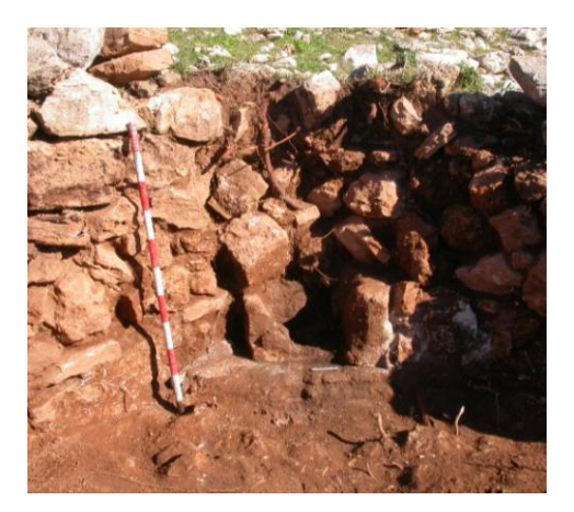
Fig. 6- The fireplace into the corner of the fort

The plan is rectangular, regular, with the door opened near the southwest corner of the south long side; though no longer visible, in the middle of the opposite long side, it had to be a window. Inside the fort, it has brought to light a fireplace located in the northeast corner of the room with still inside layers of ash (Fig. 6).