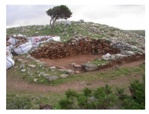
Fig. 5- The fort-house during the excavation

This fortified house (Fig. 5) was built at the SW corner of the cyclopean monument, using stones removed from the ancient structure.