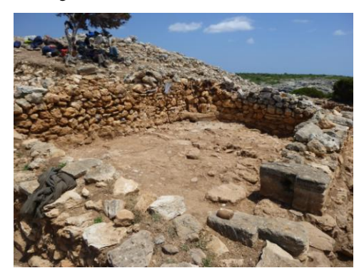
Fig. 7- The inner well-trod soil

powder, and the wall of the cavity, seems made for the purpose of the production of lime by burning the available limestone material.