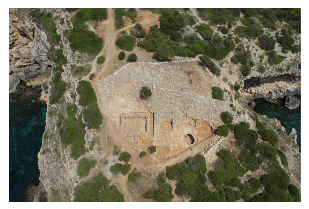
Fig. 4- Aerial view of the main monument, and of the excavated area. Here are clearly visible, on the left, the rectangular plan of the lookout and, on the right, the rounded perimeter of the cistern, by G. Taboad

The promontory, which rises on the sea with cliffs that exceed 30 m in height, has low vegetation of juniper and lentisk that conceals dry stone structures hardly visible.