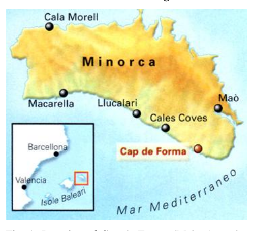
Fig. 1- Location of Cap de Forma (Mahon) on the island of Menorca

The research initially had the aim of investigating in depth the cyclopean monument, in order to determine the period of construction and the culture to which it belonged.