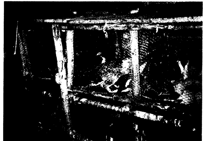
Example of use of local resources : building materials, equipment and breeding stock

A real opportunity exists to foster human development by assisting needy families through a grassroots level, village-based rabbit program. In the surrounding countries of Kenya, Sudan, and Tanzania, rabbit production has been described as a suitable activity for rural farmers as a source of food protein and income (EL AMIN, 1978; MGHENI and CHRISTENSEN, 1985; WANJAIYA and POPE, 1985). It is proposed that the primary goal of the rabbit project intervention is to offset malnutrition through the regular consumption (1-2 fryers per week) of rabbit meat, based on a small operation (~5-does). In addition, a village based project in which farm resources (feedstuffs, building materials, and family labor) are utilized can dramatically reduce production costs, such that the regular consumption of inexpensive meat by the family can be easily justified. At low production costs, opportunities will exist for successful market development and income generation through the sales of surplus fryers.