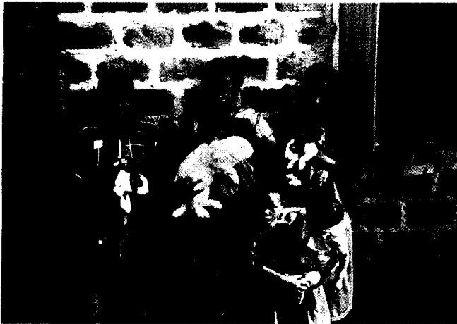
Village-scale rabbit enterprises managed by women

In a semi-confinement, free-range system (as observed in Tororo district), local rabbits are recommended for utilization by farmers. These animals display vital adaptation characteristics: small body size, presumed low nutrient requirements on low quality diets, and resistance/tolerance to a tropical climate, local pathogens, and sub-optimal housing and management conditions. Small litters and slow growth to an average mature weight of approximately 2.5-3.0 kg should be viewed as a component of the favorable "economy of scale" in terms of genetic adaptation or rusticity, low cost of production, and ease of management under rudimentary conditions. It is also recommended that opportunities be sought which could lead to genetic conservation of this novel population (BOLET et al. , 1996; LUKEFAHR, 1998).