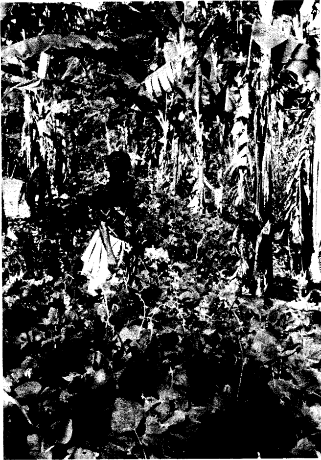
Forage plot of lablab ( Dolichos lablab ) on a small farm used to feed rabbits.