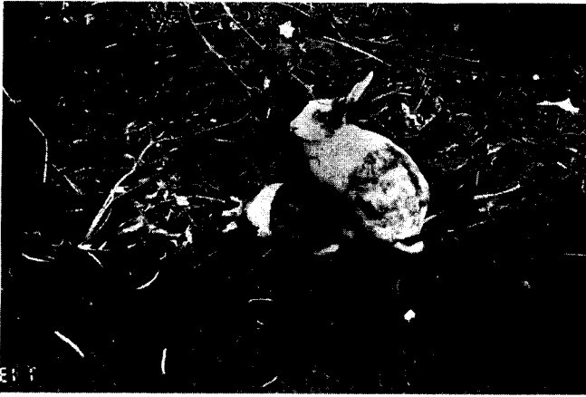
Free range-system of rabbit production