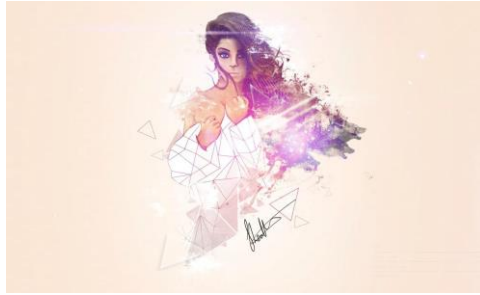
Figure 4: Evolution of female anatomical drawing

reach desired ends. Published artefacts such as that shown in Figure 4 were particularly effective in prompting motivational feedback.