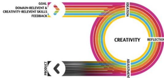
Figure 1. A metacognitive model for creative development

This study was informed by a model that synthesises this research (Figure 1). The key elements are both the creative and domain relevant skills as well as intentionality and feedback to mediate their development. This mediation is conducted through the metacognitive act of ideation, reflection and adjustment.