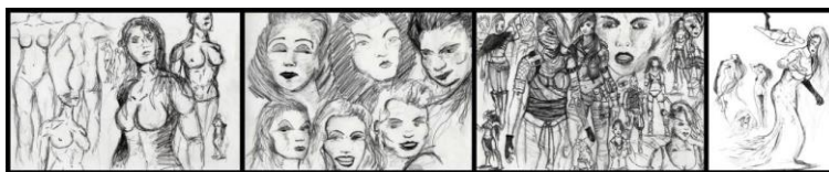
Figure 2: Rough female anatomical drawings

Better examples were when the artist posted drawings practicing the female form. These were deliberately rough in nature (Figure 2), and were accompanied by a brief discussion on human body shapes and structures that identified the drawings' need for a realistic body shape for the video game heroine. More valuable comments were then received that directed the artist to 'study how the body parts are made up of bones, sinew, musculature and fat tissue' (Participant 4) and drew attention to the anatomical drawings of Leonardo da Vinci. The external reference point of anatomical drawings enabled the recognition of weaknesses, the ability to calibrate understandings with those of others and respond by refining the work in a way that enhanced drawing skills.