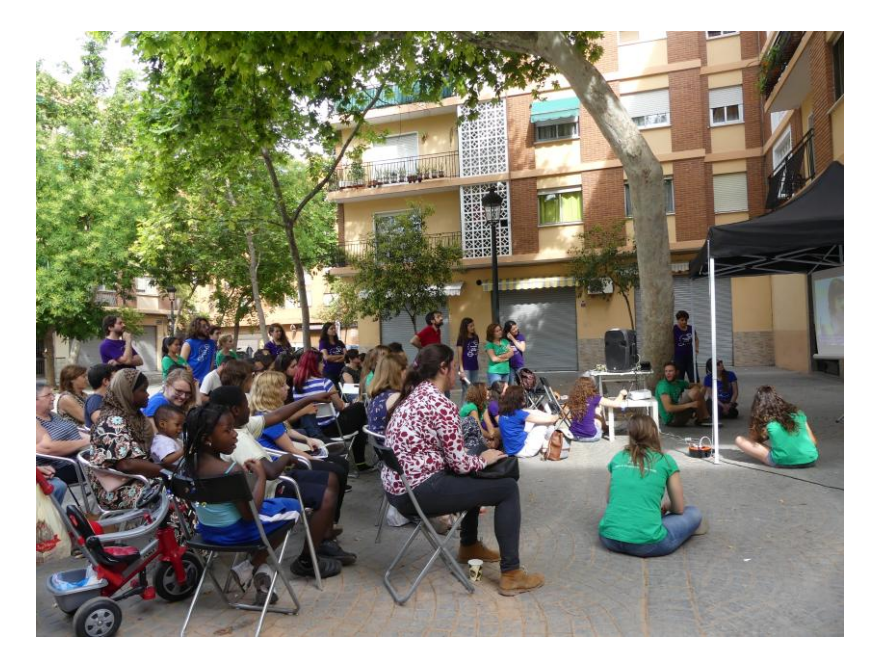
Image 1.Public presentation and space of debate with neighbors from Benicalap

The final day of the AL process ended with a public presentation of the results. In the square of the neighborhood, the 5 posters were exhibited, the video was presented and a dialogue space was created between the participants of the process and the neighbors from Benicalap. This was a key moment to share learnings and impressions, as well as to reflect on how the AL process could be contributing to improving the welfare of the young people of Benicalap.