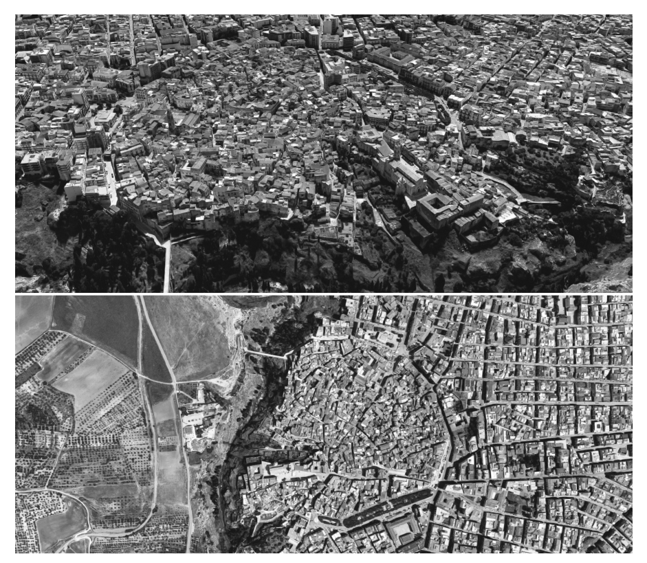
Figure 4. Historical Plastic City. Gravina in Puglia, Italy.

(cc) BY-NC-ND 2017, Universitat Politècnica de València