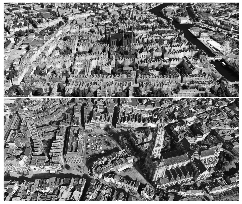
Figure 1. Historical Elastic Cities. Gdańsk, Poland (above), Antwerp, Belgium (below)