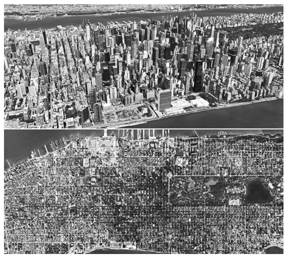
Figure 2. Contemporary Elastic City. New York, U.S.A.

(CC) EY-NO-ND 2017, Universitat Politècnica de València