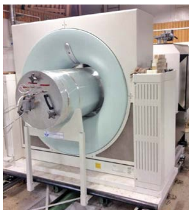
Fig. 2: Drying kiln and CT-scanner. The specimen is located in the metal tube that fits within the gantry of the scanner.