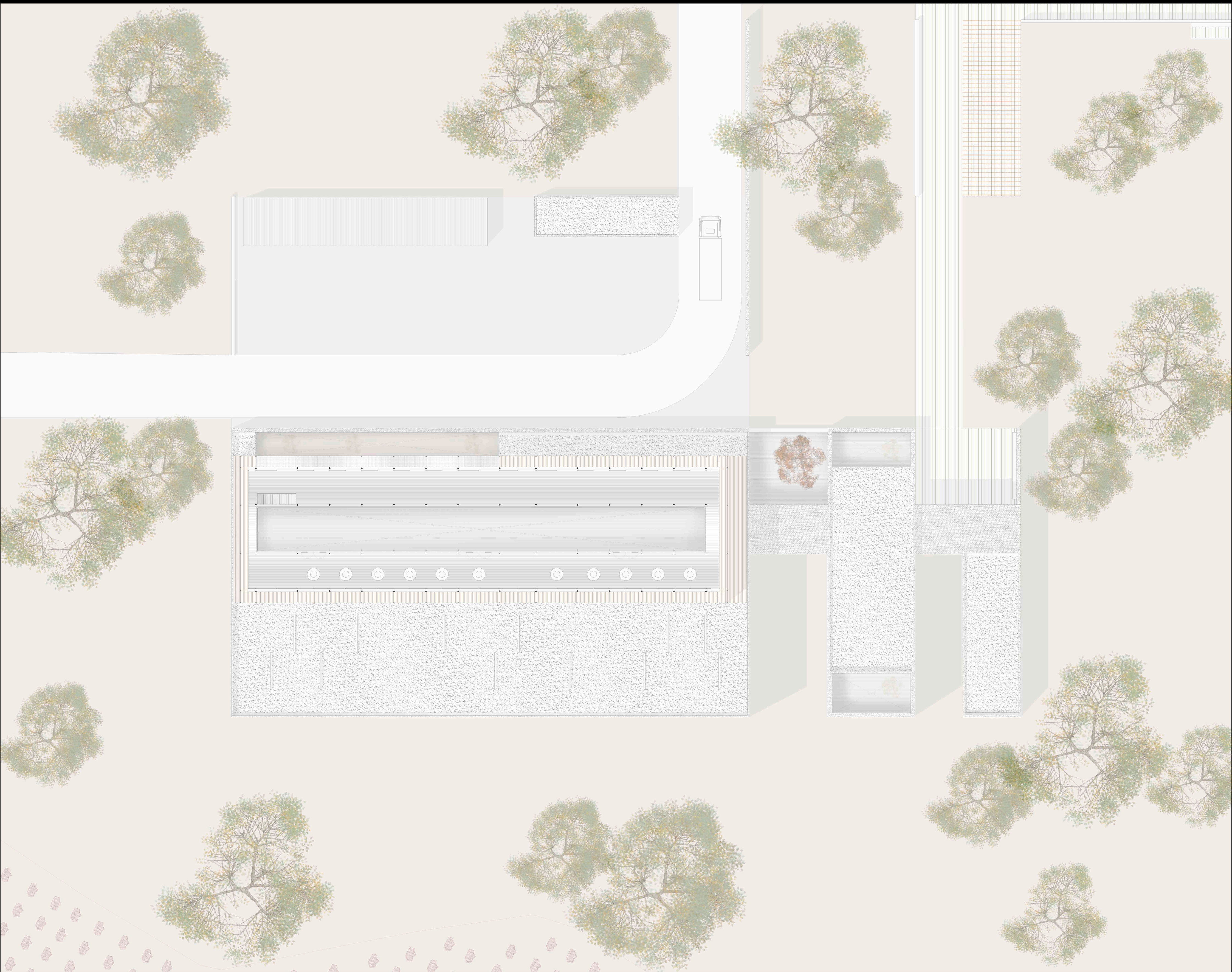
Planta primera bodega E:1/150