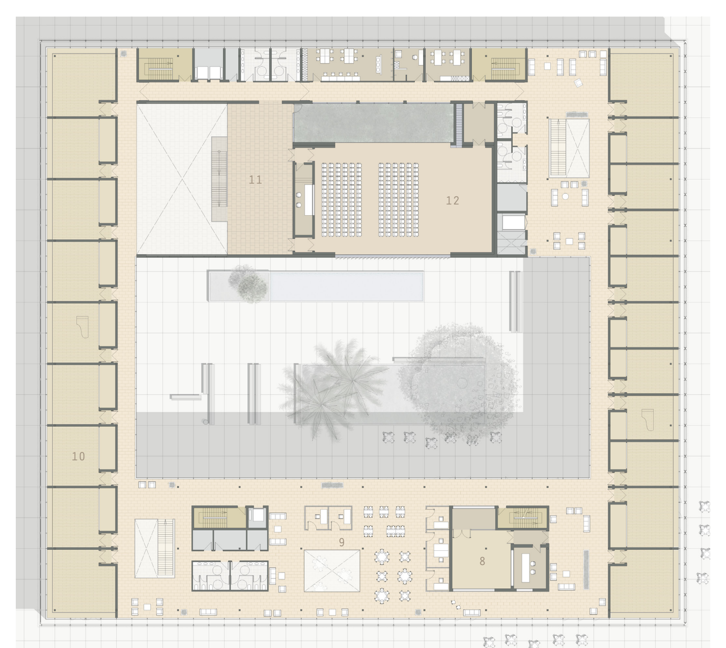
PLANTA SEGUNDA E 1/500