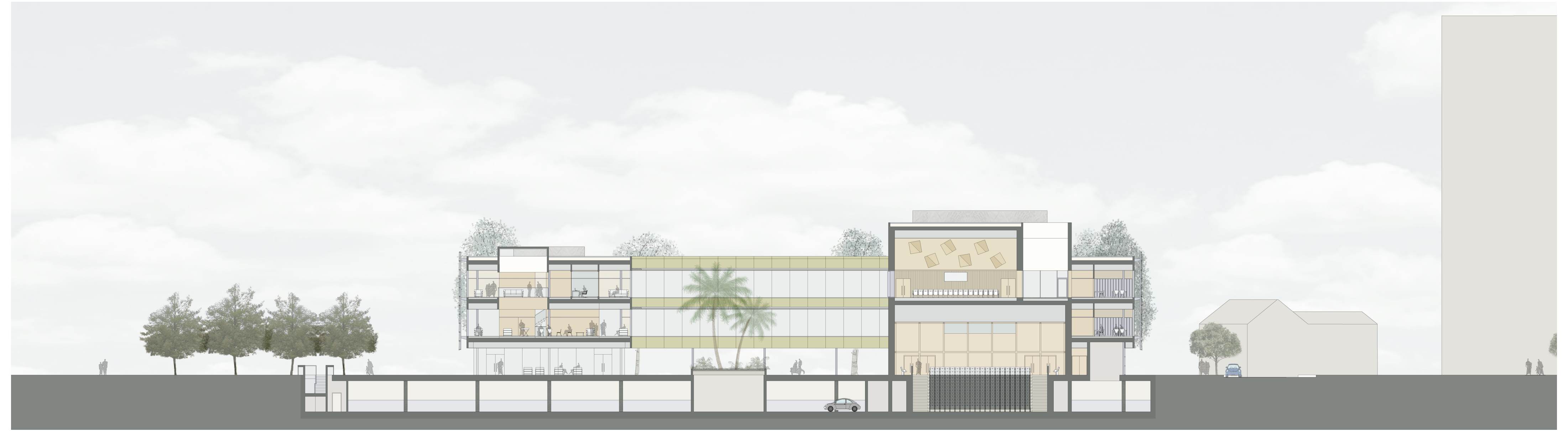
SECCIÓN TRANSVERSAL E 1/300