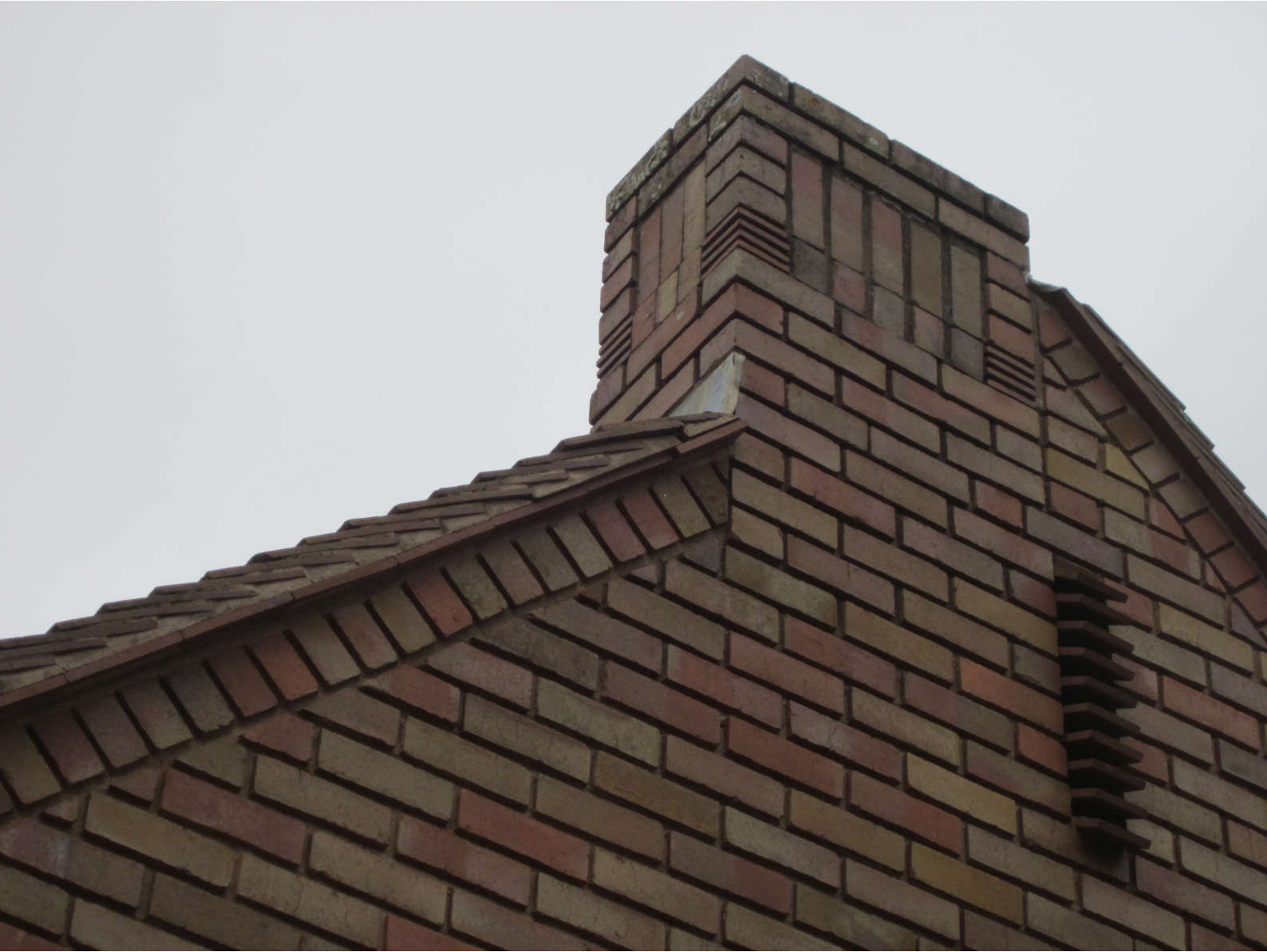
Chimney at Edrington, 2013