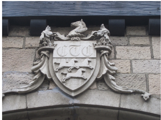
Figure 2. Clairwood Turf Club Coat of Arms most likely by Woodrow

During the Second World War, Woodrow saw active duty in which he achieved the rank of Second Lieutenant. After the war, much of his work at Clairwood involved large scale extension, such as the construction of new grandstands and towers. Photographs in his papers show similar structures in Australia, suggesting that he cast far afield for precedent for these large concrete and significantly, modern structures. Certainly, the Totalisator, constructed in 1953 and demonstrating a distinctive move towards a slimmed down modernism is telling. Between the mid-1950s and the mid-1960s he entered into partnership with Austin Collingwood.