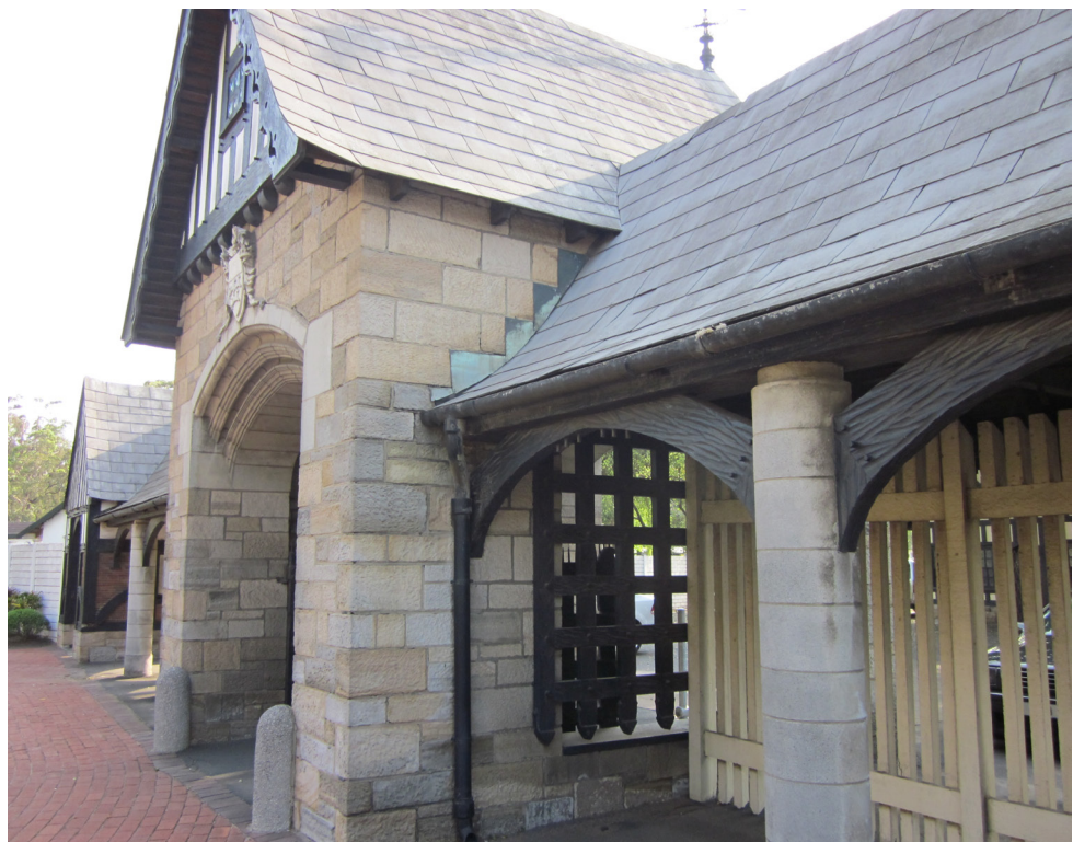
Figure 3. Entrance gate to Clairwood Turf Club ca 1950s, now demolished

Indeed, in the same speech quoted above, Woodrow declared that Sir Thomas More's Coat of Arms formed a substantial template for that of the Thomas More School (as it was known at the time), with the inclusion of the three morecocks, as well as a 'small gold cross superimposed upon the chevron'. He stressed from this that 'The cross has been included because it is the most venerated of all Christian symbols. It is a mark - indeed it is THE mark of Christianity - Christianity from which our Western culture emerges bringing with it that most admirable and outstandingly successful