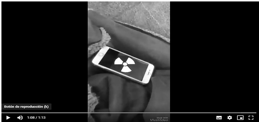
Figure 3. Image of another of the videos, which exemplifies an everyday situation with transcendence for the «consumer law»