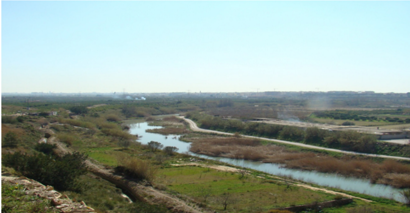
Figure 2: River Túria floodplain in the borough of Manises (Valencia).

legal, technical and administrative organizations and structures used in the irrigation assimilated to the concept of TEK, and traditional agroecosystem landscapes such as the water meadow systems. These buildings, engines, knowledge and landscapes are part of the history, customs and identity of the community they belong to, but they are also still in operation, being a vital element in the current regional economy.