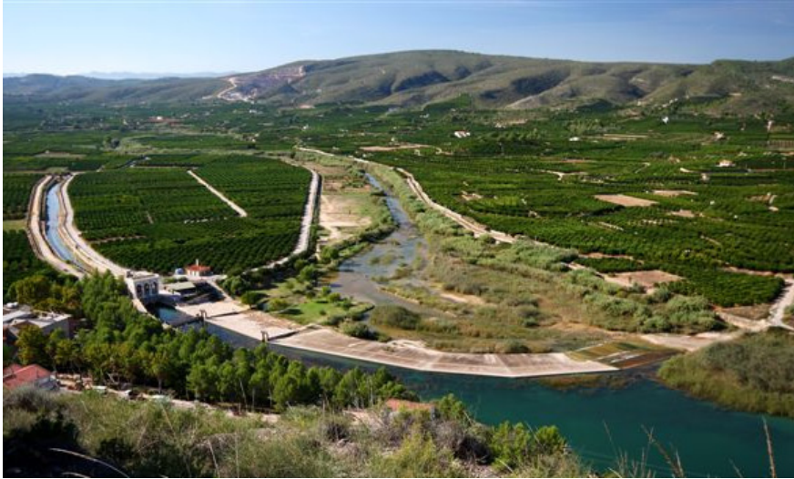
Figure 3: The Antella Weir on the River Júcar.

Moreover, the Acequia Real del Júcar was built by King Jaume I in the 13th century. On completion, its management came under the control of the royal officials, who gradually yielded attributions to the irrigators. In 1350, the Ordenanzas , the first regulations giving executive competencies to the irrigation community, were written. This institution currently consists of ten members who meet monthly to decide on water management and it also has its own local irrigation court to solve conflicts among farmers in a peaceful way.