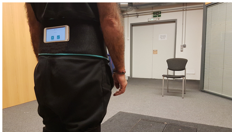
Fig. 1 Participants' instrumentation

Two variables were calculated for the postural control variables: i. Medial-lateral displacement (MLDisp) : 90th percentile of the ML excursion of the center of mass (COM), measured in mm and calculated by double integration of the acc signal [26] and an inverted pendulum model [25] ii. Anterior-posterior displacement (APDisp) : 90th percentile of the AP excursion of the COM, measured and calculated in the same way as above. Both are common variables used in the