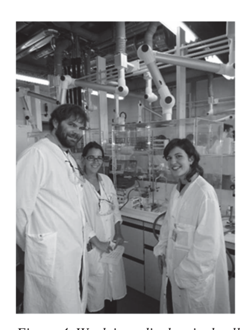
Figure 4. Work in radiochemical cells during JUNCSS