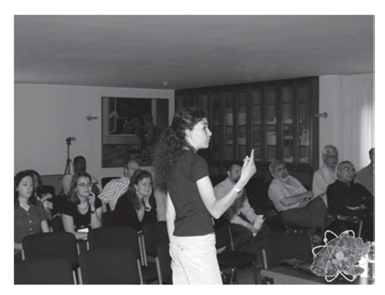
Figure 3. Student presentation at the 2008 workshop in Favignana