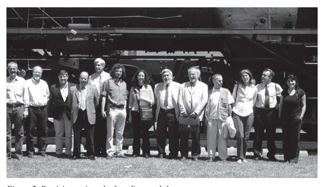
Figure 2. Participants into the founding workshop