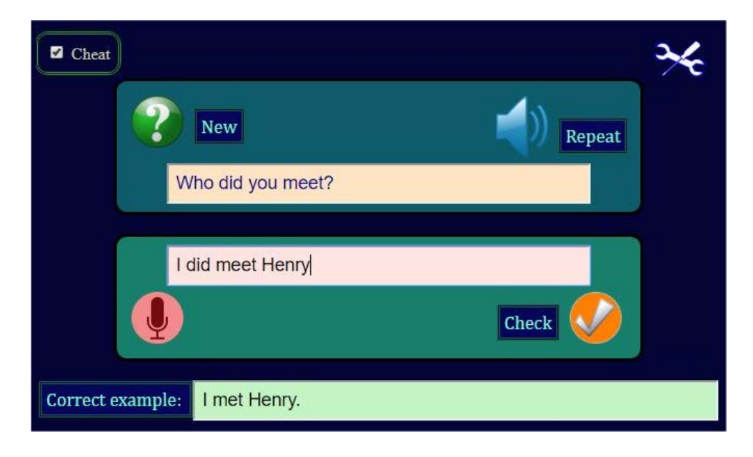
Figure 5. Main screen for "q-ask".

Figure 5 shows the main screen. Clicking on "New" generates a question. The microphone icon allows you to speak your answer, or else you can type it. The "Check" button allows you to check your answer. If incorrect, a correct example will be shown. Selecting "Cheat" displays the correct example before inputting your answer. By clicking on the speaker icon, you can hear the question again. Lastly, clicking on the tools icon allows you to adjust settings.