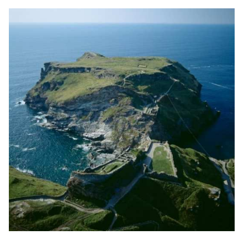
Fig. 4. Photograph of Tintagel Castle before the installation of a new access bridge, reaffirming a medieval connection, in 2019.