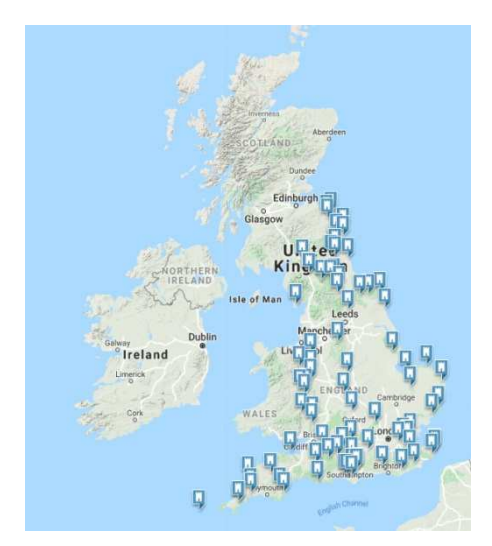
Fig. 1. Graphic representation of the distribution of castles in the care of EH in context of British Isles and Ireland.

English Heritage is a charity that cares for over 400 historic sites and properties across England. Among these are over 70 castles which are some of the most popular and historically significant buildings in the country (Fig. 1).