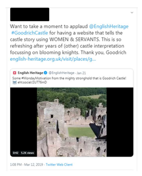
Fig. 2. Twitter user's comments regarding web-based interpretation of Goodrich Castle.

Richmond) whose interpretation was recently overhauled (Fig. 2 yFig. 3).