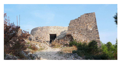
Fig. 5. The remains of Fort Turina today (Sančanin, Suljić, 2018).

The remains of a fortification called Turina (archaic Croatian for "tower") are still very prominent on the hill above Skradin. It consists of a round tower and the quasi-bastion on its southeastern side.