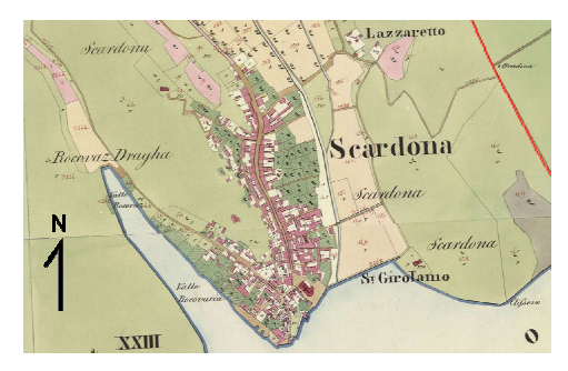
Fig. 4. Cadastral map of Skradin, 1827 (Šibenik City Museum).

Skradin was once again, after the expulsion of the Ottoman army and civilians, populated by new inhabitants -Morlacchi people from hinterland, which were led by their leaders, "harambaše" (haramibaşı). The Venetian rule was stabilized by the first decade of eighteenth century, with the new division of the land, formation of administrative structures and the restoration of the old Skradin diocese. The town had remained sparsely populated, because the new population was concentrated around the fertile areas on the outskirts. Almost forcibly, the Venetians formed a separate municipality in 1706, along with the "nobiliary council" composed of foreign military officers and most powerful harambaša's. By the end of eighteenth century, only 7 council members actually lived in Skradin, and sessions could not be held (Soldo, 1991, pp. 140-147). The commercial activities and connections have mostly been restored, but the town infrastructure was deficient, and the swampy ground and insects led to the spread of disease and "unhealthy air".