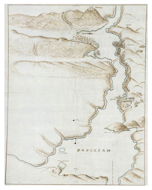
Fig. 9. Venetian assault on Skradin, 1647, north is left (ASVe, Dispacci, Rettori Dalmazia, f. 52, dis. 1).

The next collection of sources, made during the War of Crete, are confirming the claims about another fortification, made by Foscarini more than 70 years ago. Two defensive positions in Skradin are routinely mentioned during the three