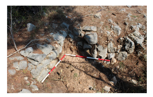
Fig. 11. The corner between the curtain wall and south-eastern tower.

More detailed inspection revealed the location of south-western tower, along with some walls going towards the north. Additional works will not be possible before the area is at least partially cleared of vegetation, and the removal of some recent dry-walled structures.