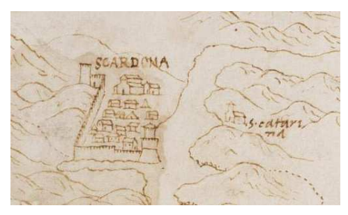
Fig. 7. Skradin around 1510, north is left (Barzman, 2014).

The first historical data about the fortifications of Skradin come from early sixteenth century, on a map depicting the Dalmatian hinterland, drawn around 1510 (Barzman, 2014). It shows a town with walls stretching from the coastal tower towards the one on the hill, the last one obviously being Turina. Somewhat less precise and wellknown map published by Matteo Pagano in late 1520s also shows the town of Skradin encircled by walls.