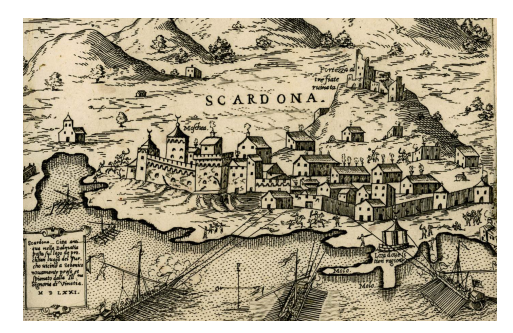
Fig. 3. G. F. Camocio, Scardona, città antiqua nella Dalmazia , 1571, north is up (Šibenik City Museum).

However, an extended peacetime after these two Venetian-Ottoman wars had an initial positive effect to local economy. Archival sources are showing that the new inhabitants of Skradin (both Christians and Muslims) have moderately prospered due to favourable trading and agricultural conditions. The land was divided among the members of military elite, and they, along with some craftsmen, were exempted from certain taxes (Buzov, 2009). All of this is even more evident when reading the reports from the conti et capitani of Venetian Šibenik, with many grievances about the ways that this prosperous marketplace in Skradin is limiting their own trade (CRV, tom. VIII, pp. 194-195).