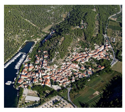
Fig. 1. Aerial view of Skradin from the south.

ceeded in developing permanent political, economic and societal structures typical for the communal era.