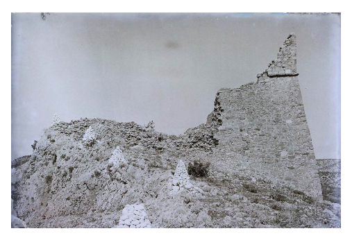
Fig. 6. The remains of Fort Turina, late nineteenth century (Marasović, 2009).

Despite many fragments of mortar and stones all over the hill above Skradin, Fort Turina is the sole clearly defined defensive structure within the town. The round tower could be a typical mid-to-late medieval fortification, and is often (although without any precise evidence) connected to the powerful magnate Pavao I. Šubić which governed the area in the second half of thirteenth century. The quasi-bastion is obviously an Early Modern addition.