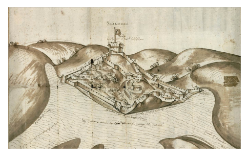
Fig. 8. Veduta of Skradin, early-to-mid sixteenth century, north is up (Archivio di Stato di Venezia [ASVe], Provveditori alle Fortezze, b. 82, dis. 102).

Fort Turina, or some other fortified location in the hinterland. A year later, Dalmatian provvedi tore generale , Jacopo Foscarini reports that Scardona is "debole senza artellaria spianato ma novamente hanno poca piu alto fabricato un ridotto (marked by J.P.) per esser piu sicuri delle galere" (CRV, tom. IV, 1964, p. 43).