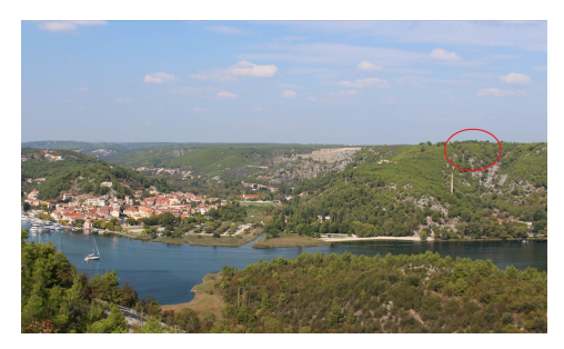
Fig. 11. Location of the Ottoman fort (J. Pavić).

The first reconnaissance survey was made on October 5<sup>th</sup>, 2018. The terrain on the Gradina hill is covered with vegetation made mostly of Aleppo pines and thick low bushes ( maquis ). The area is criss-crossed with dry-walled trenches and bunkers, leftovers from the retreat of German army in late phases of World War II. An elevated position was noticed, but the access to it and overall movement on the terrain was limited.