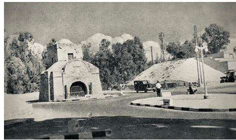
Fig. 5. Kyrenia Gate and city walls (Kemal Rüstem, 1961).

As it is understood from the existing photograph, only a 3-4 m long part of the city walls passing through the middle part of the square was built by the British to reshape the earth structure using cut stones. This modification on the city walls probably took place between 1950 and 1956 and led to other restructuring or renovation activities in the surrounding environment. In the 1961 book Kıbrıs (Cyprus) , a collection of photographs by Kemal Rüstem from different parts of the island, there is only one photograph of the city walls, showing a small section between the Kyrenia Gate and Barbaro Bastion (Rüstem, 1961) (Fig. 5).