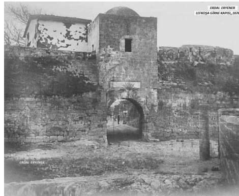
Fig. 2. Kyrenia Gate.

at the island (Fig. 2). The rectangular marble slab with the Sultan's tughra depicts the repair performed on the gate during the Ottoman period in 1821. During the reign of Sultan Mahmud II the structure underwent a restoration and a domed, four-corner room was built on the door (Gürkan, 1996). In addition to the east corner of the domed room viewing west, another room with a double-gabled roof was built on the fortification wall with a connection almost adjacent to the eastern corner of the domed room. To the west of this domed space, a stone wall was constructed with holes or openings for cannons.