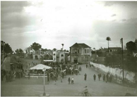
Fig. 4. İnönü Square festivities (Tuncer Bağışkan, 2011).

January 1 st , 2011 stated that the first location used for holiday celebrations was the Sarayönü Square, but it was later moved to the İnönü Square and this area was used as a second center of festivities in Nicosia between 1945-1956 (Bağışkan, 2011). In Gürkan's account the place for celebrations was Sarayönü until 1940 and was transferred to the Kyrenia Gate (İnönü Square) in 1940 to remain there until 1955 (Gürkan, 1996). Bağışkan provided information about the square for festivities and its surroundings, especially the section to the south of the square, as well as a photograph (Bağışkan, 2011) taken before the Ford Garage was built in 1947 or 1949 (Fig. 4).