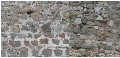
Fig. 4. Construction Techniques of Güzelhisar and Amasra Castle.

However, when the measurements taken from the wall surfaces of the defense structures are compared, it is seen that many architectural elements are similar in Amasra and Güzelhisar Castle and the walling techniques are similar (Fig. 4). Different qualities and colors of stones were used. Dimensions of stones are min. 30 and max. 50 cm. White colored khorasan was preferred as binder mortar. Similar size and quality of stones were preferred on the edges and the tops of the doors.