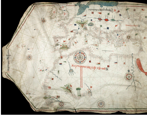
Fig. 2. Portolan Chart of Aguiar (1492).