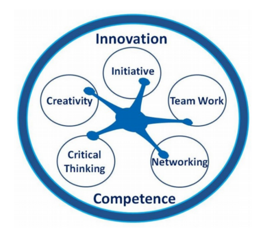
Figure 1. The FINCODA Innovation Competence Model (FINCODA Team, 2017)