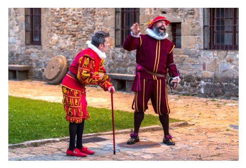
Fig. 3. Scenic Tour "Memoria de la Piedra" in the Citadel of Jaca, ES.

There are scenic tours on the citadel of Jaca, where the guests follow actors through the fortress and learn about the history of the citadel. In La Línea de la Concepción three centuries of Spanish architectural history are connected with the Spanish-English conflict of Gibraltar. In La Villajoyosa, Alicante, Denia and many other cities the festival of the Moors and Christians is celebrated every year.