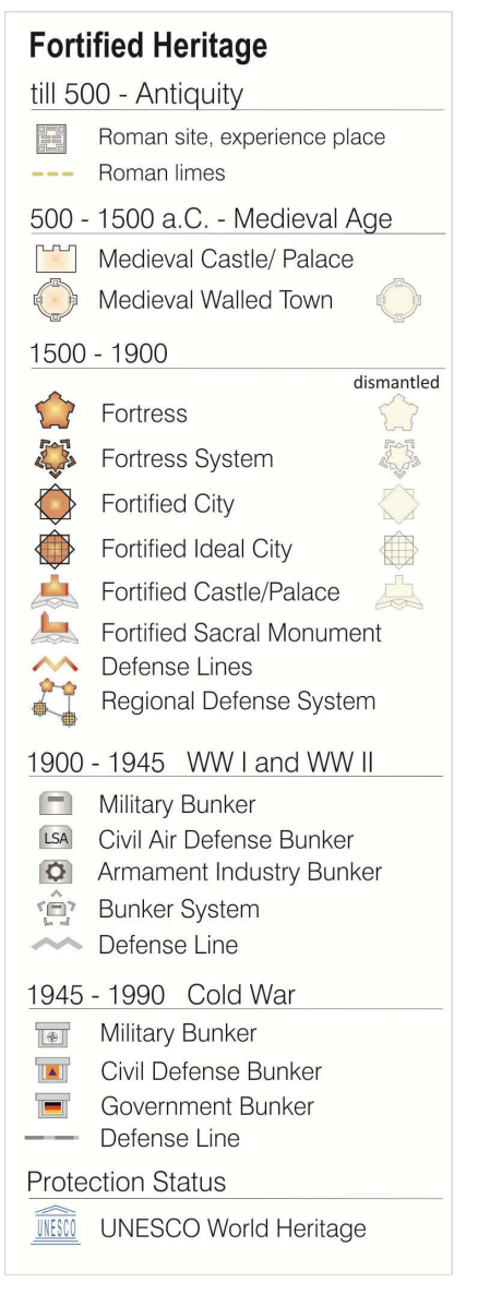
Fig. 1. Categorization of the fortified heritage (ECCOFORT e.V. 2019).

To get important insights into the localization and the diverse fortress types, ECCOFORT developed a map of the Iberian fortification heritage. For the first time the whole historic spectrum of fortified monuments over the important epochs until the Cold War is collected. This is not finished.