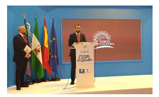
Fig. 4. FORTE CULTURA® presentation at the FITUR 2019 in Madrid at the booth of Campo de Gibraltar.

In Spain, this will happen under the lead of the city La Línea de la Concepción in the tourism region Campo de Gibraltar.