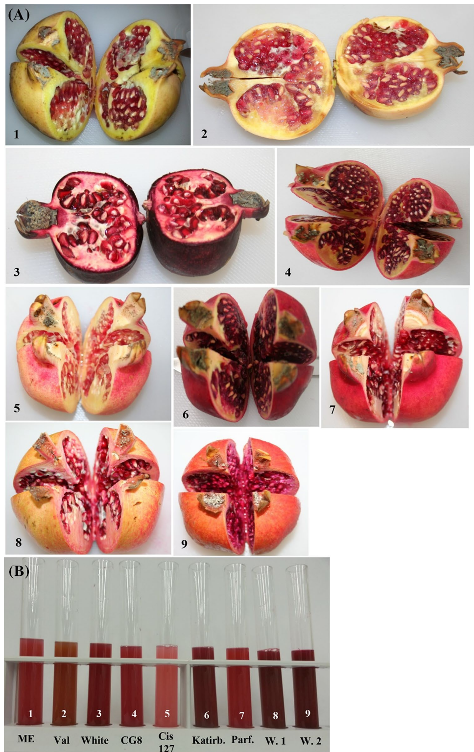
Fig. 1 Pomegranate fruits (a) and juices (b) of nine cultivars grown in Spain: 1—Mollar de Elche, 2—Valenciana, 3—White, 4—CG8, 5—Cis 127, 6—Katirbasi, 7—Parfianka, 8—Wonderful 1, 9—Wonderful 2

[45] and Rajasekar et al. [46]. The method consisted in using two buffer systems: potassium chloride buffer at pH 1.0 (0.025 M) and sodium acetate at pH 4.5 (0.4 M). 250 \mu l of juice was diluted with pH 1.0 and pH 4.5 buffers in 25 ml flasks and allowed to stand for 30 min at