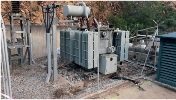
Figure 2: Adequacy of power transformer (Endesa Generación-Enel Green Power).

The actions that have been mainly indicated as a function of the analyzed faults, indicate a series of actions grouped in: