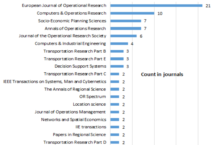
Figure 2: Top 20 journals in terms of frequency of the papers relevant to the USFL.